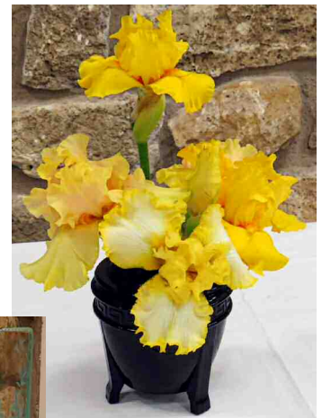
Tracey Rogers 2015