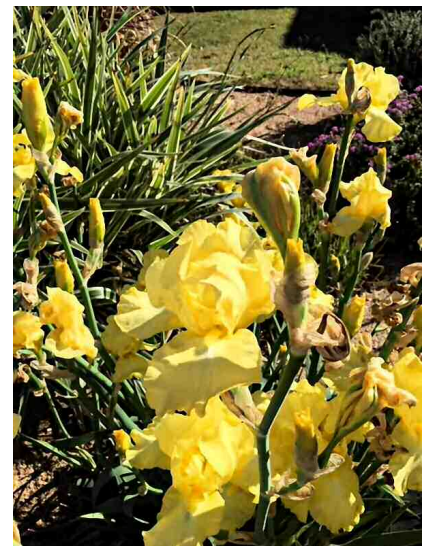
Yellow irises on the corner of Chestnut and East 22 nd Street, Feb. 6, 2016