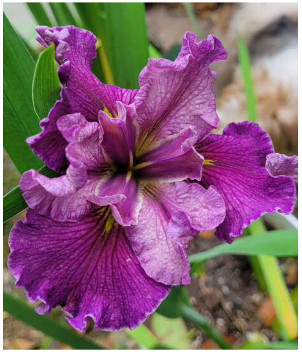
'Blueberry Mousse' - Jackson 2015