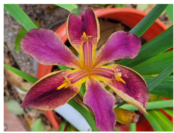
'Purple Gloaming' - Grieves 2007

Submitted for Approval on: September 13, 2022