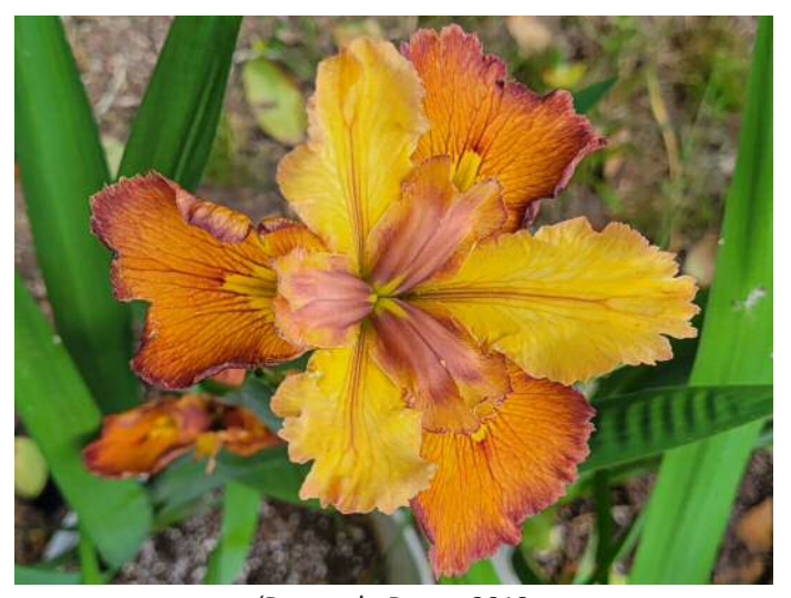
'Rooster' - Betzer 2013

At 24 inches apart there is enough space for 3-4 years between planting.