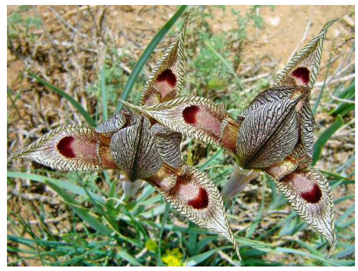
Iris acutiloba subsp. lineolata, Iran, Fars province, Zagreb Mtns, 2350 m/7710 ft