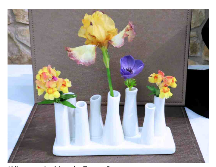
'Aliens on the Moon' – Tracey Rogers