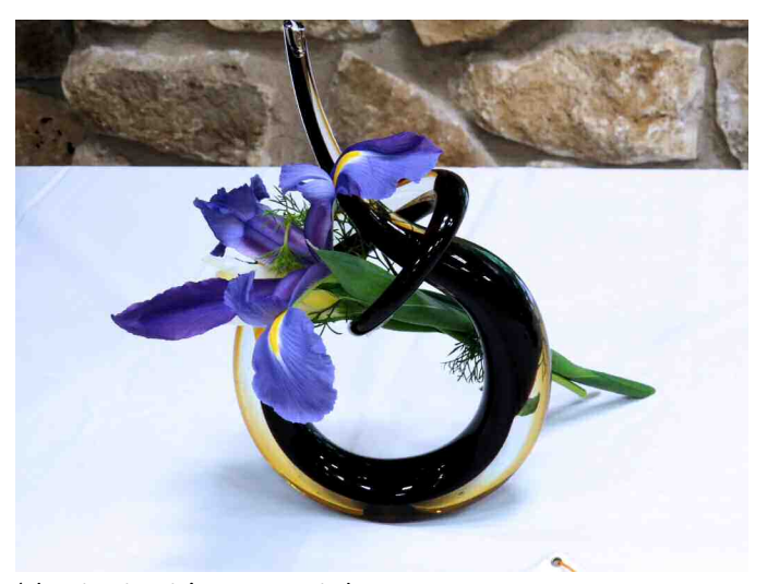
'Floating in Iris' – Donna Little