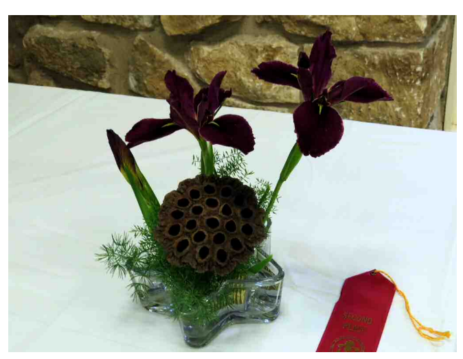
'Constellation ORION and Black Hole' --Dara Smith

night ant. They are in Central Texas gardens, where they live in great colonies of millions that harvest weeds, grasses, and forage crops—including iris foliage—by carrying pieces of material to their