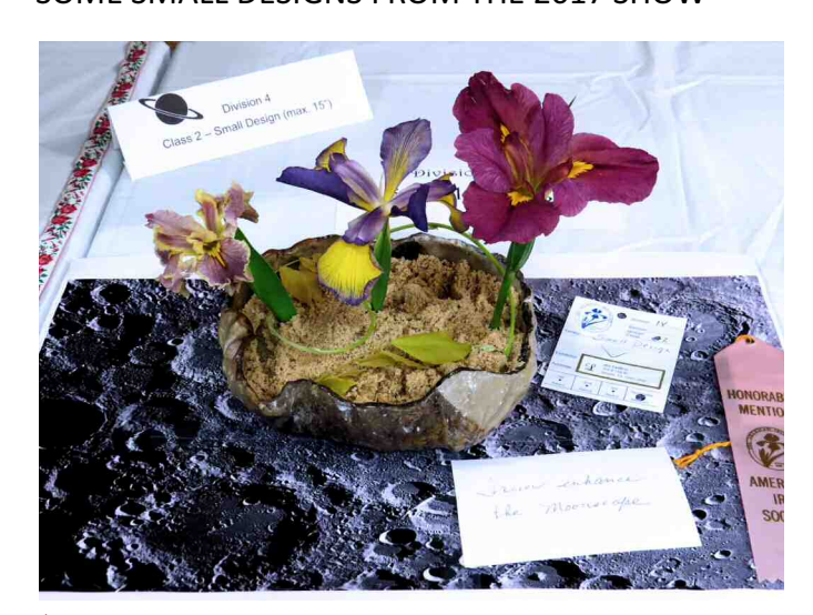
'Irises Enhance the Moonscape' - Jim Landers