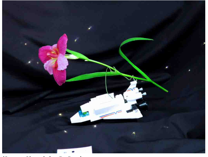
'Space Shuttle' - D. Boyle