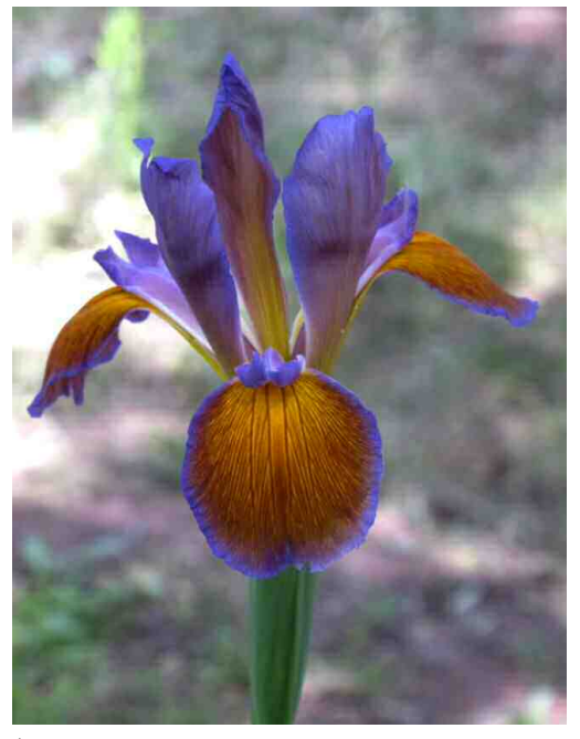
'Carousel of Delight' SPU Cadd 2006

September 8 ISA Rhizome Sale 9A.M–3P.M. Norris Conference Center 2525 West Anderson Lane Austin 78757