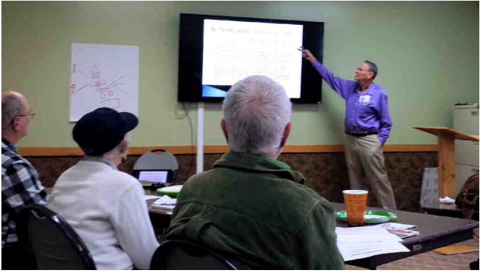
SDB Cook-Douglas Medal Winners