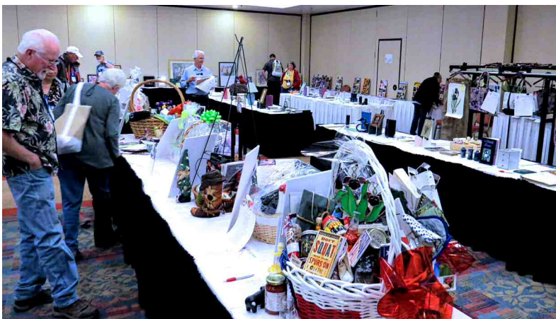
Region Baskets in the Convention Silent Auction Room