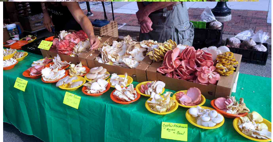
Above: Garden judging and crowds in the Collins Garden; ISA members in front of the GDMBG Conservatory; gigantic hostas in front of the Juriks' house; different varieties of mushrooms for sale at the Farmers Market.