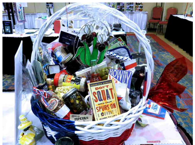
The Region 17 Basket