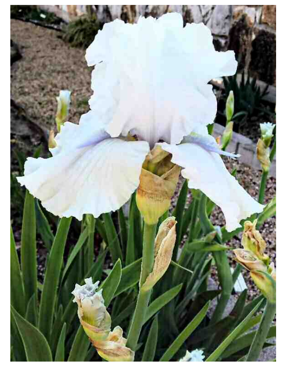
'Austin City Blues' (Nichols 2009)