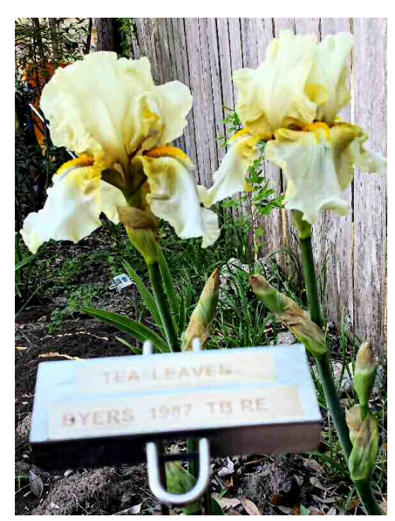
'Tea Leaves' (Byers 1987)