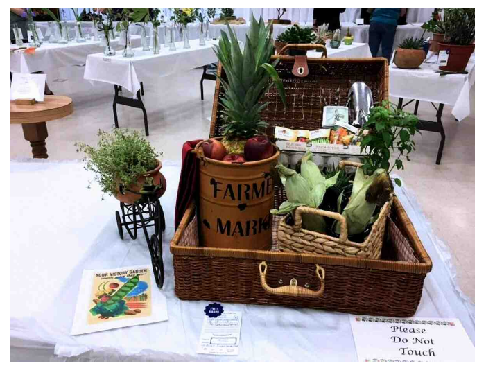
Ellen Singleton's 'Farmers Market' design