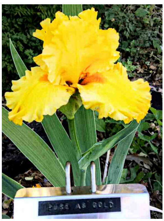
'Pure as Gold' (Maryott 1998)