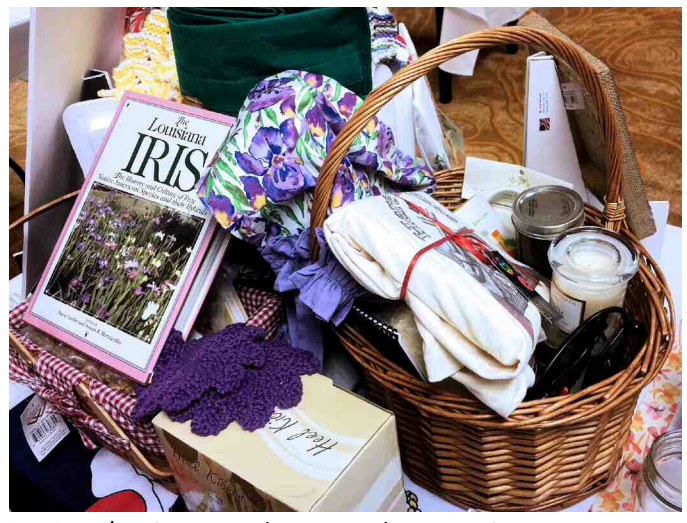
2016 AIS/Region 17 Basket, Newark Convention