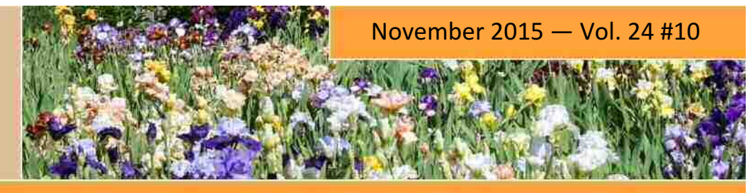
A Monthly Newsletter of the Iris Society of Austin