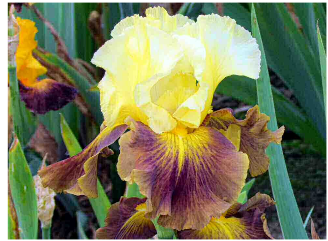
'Sing with Frogs'