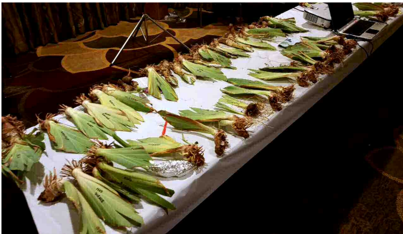
Rhizomes for the auction