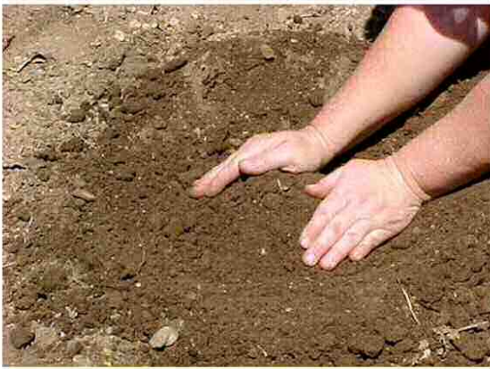
Figure 1: Build up a small mound of soil in the center of the planting hole.