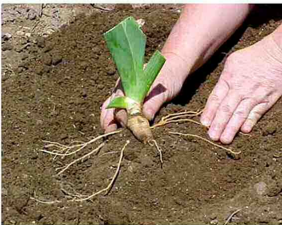
Figure 2: Center the rhizome on the soil mound and spread out the roots on either side.