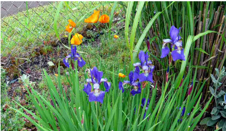
Irises at Dismal Nitch

We followed the coastal highway all the way down to Tillamook, stopping several times on the beaches at Surf Pines, Seaside, and Cannon Beach, where we recognized the enormous Haystack Rock which ISA members visited during the 1994 Convention. There were white specks all over Haystack Rock, and a sign stated that every spring a colony of Tufted Puffins return to Haystack Rock from their long winter at sea. One of the pictures I took with my camera lens zoomed in to the max reveals that those white specks were indeed puffins. As we drove through Cannon Beach, we noticed cute white, black, and orange/tan bunnies leisurely munching grass along people's driveways. They were wild, yet looked like colorful Easter bunnies. In Tillamook we arrived too late to visit the large cheese factory, which also produces excellent ice cream, but we found a charming country restaurant on the outskirts of town where we had dinner. I had perhaps the world's largest club sandwich that was at least four inches thick.