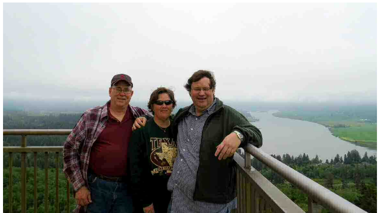
Texas Gypsies atop the Astoria Column