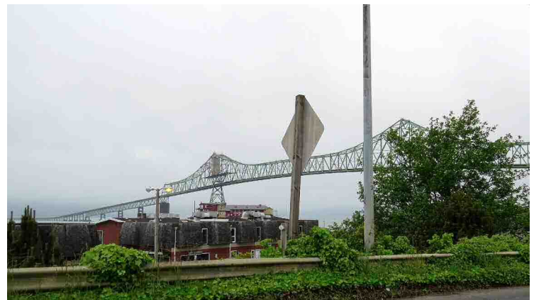
The long bridge viewed from the Astoria side of the Columbia River.