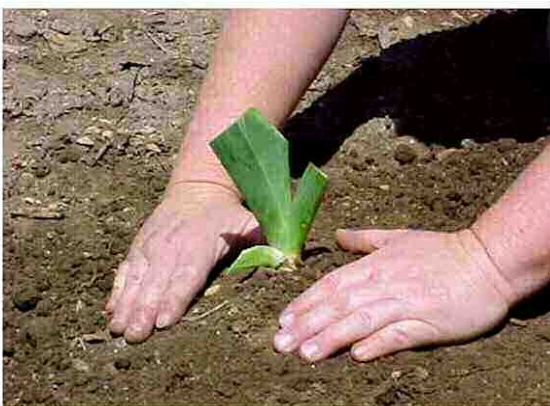
Figure 3: Firm the soil around the roots. Newly planted rhizomes should be watered thoroughly.