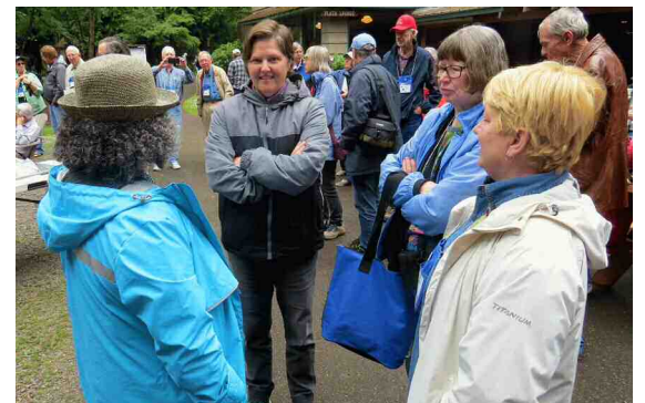
After lunch at Canby Grove