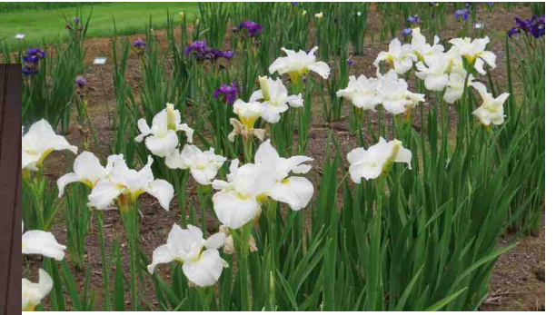
'Birds in Flight'