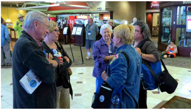
Waiting for the buses to arrive