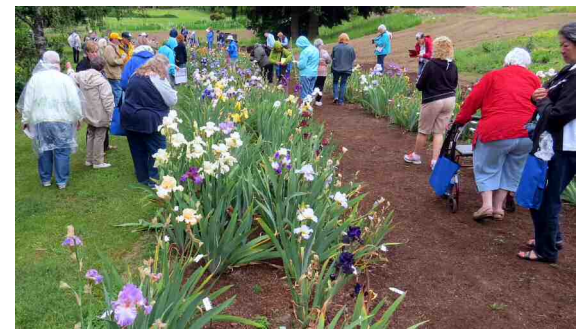
Aitken's Salmon Creek Garden