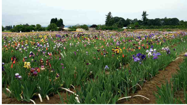
The view behind Schreiner's Display Gardens