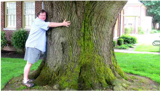
Tree-hugging at Fort Vancouver