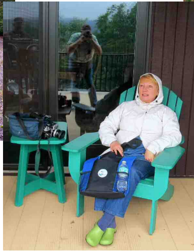
On the deck at Mt. Pleasant Iris Farm