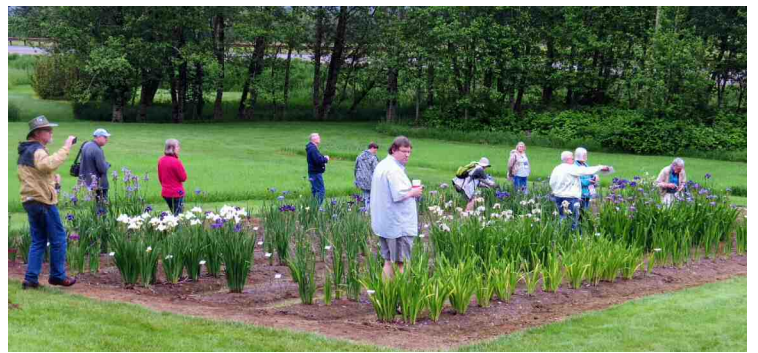
Beardless iris bed