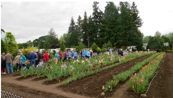
Miller's Manor Gardens