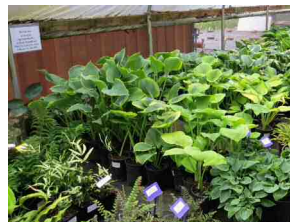
Hostas for sale