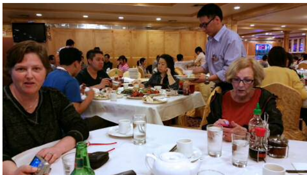
Dinner in the "new" Chinatown