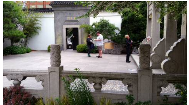
Courtyard entrance to Lu San Chinese Garden