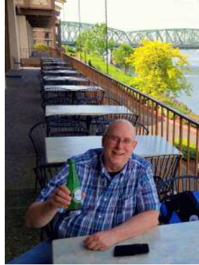
A ginger ale by the river