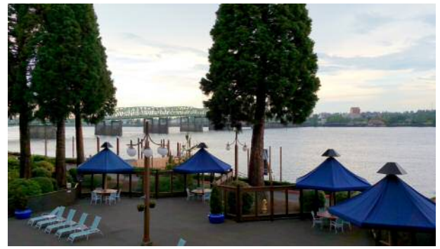
Columbia River bridge, viewed from hotel room