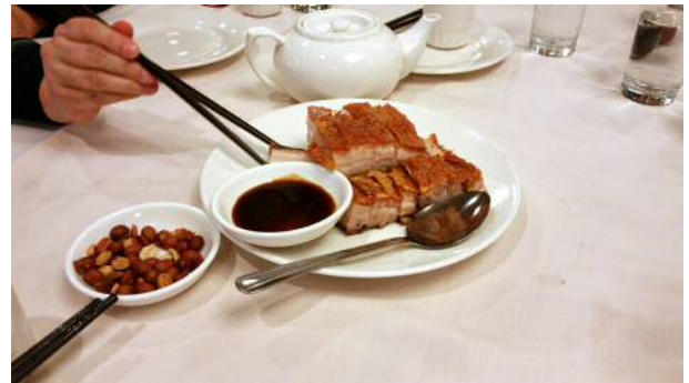
Barbecued "ribs" – no, pork bellies