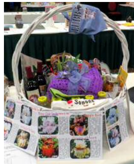
The Region 17 gift basket in the Silent Auction