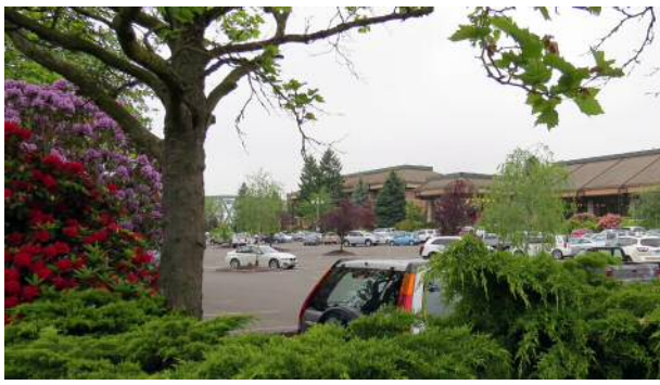
Red Lion on the River Hotel