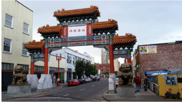
Entrance to Portland's historic Chinatown