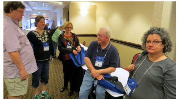
Taking a break between section meetings