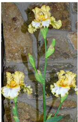
'Al's Gal' Ellen Singleton