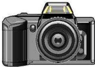
PHOTO CONTEST DEADLINE JUNE 30