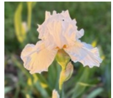
Wings of Peace, Sutton-G, 1997 SA

The second bloom to greet me was "Wings of Peace", one of my favorites because of its consistent great performance and its strikingly pure white color. In the attached picture, the pure whiteness of the falls reflects the colors of evening sunlight.