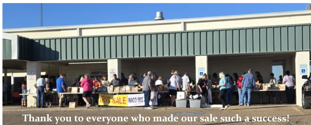
Thank you to everyone who made our sale such a success!