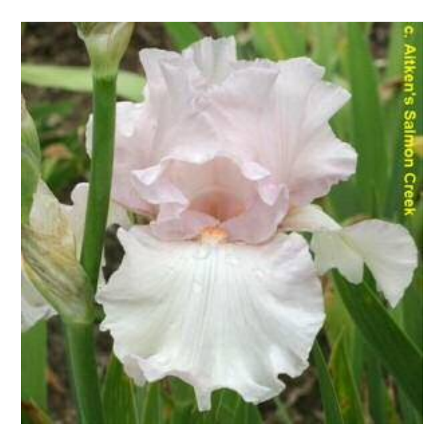
'Pink Presence' (Lynn Markham, R. 2007) TB, 34" (86 cm), M. S. clear light pink; style arms creamy, frilled pink crests; F. creamy pink center shading to clear light pink at edges, deeper pink at hafts; beards white tipped red-pink; ruffled, stardust petal finish. Aitken 2008.