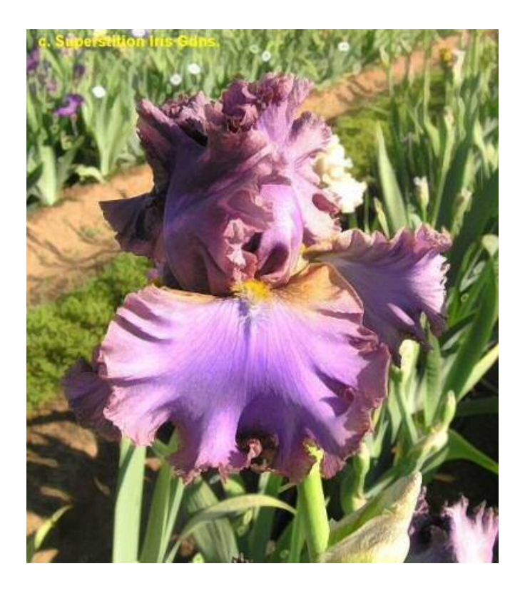
'French Lavender' (John Painter, R. 2010). TB, 38" (97 cm), Midseason late bloom. Standards lavender purple blending to wide mauve edge; style arms lavender purple; Falls same, mauve edges, gold shoulders; beards gold, white at end; laced, ruffled; spicy fragrance. 'Napa Country 2011.