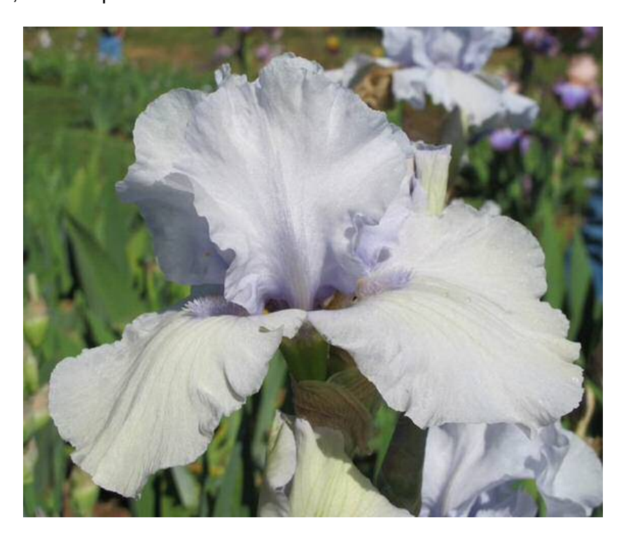
'Porcelain Art' (Michael Sutton, R. 2008) TB, 33" (84 cm). Midseason late to very late bloom and rebloom. Standards wisteria blue veined darker; style arms wisteria blue; Falls white, hint of peach pink at shoulders; beards flamingo; pronounced sweet fragrance. Sutton 2009.