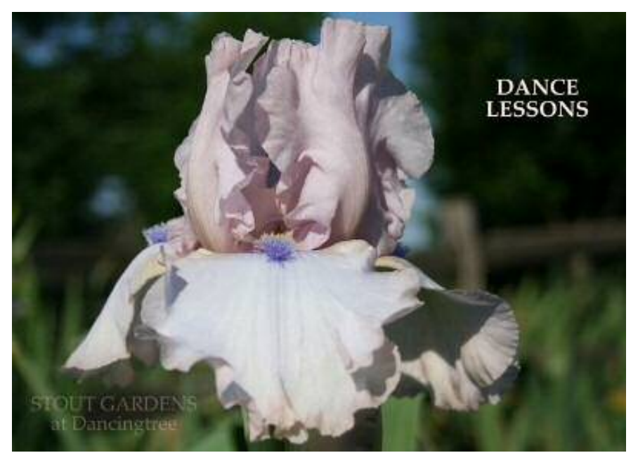
'Dance Lessons' (Jack Worel, R. 2013) TB, 35 (89 cm), Midseason bloom. Standards and style arms light baby-pink Falls same, 3/16" darker pink rim; beards outer half blue, inner half yellow; slight sweet fragrance. Stout Gardens 2013.