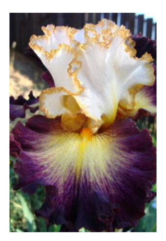
'Super Hero' (Joseph Ghio, R. 2011) TB, 38 (97 cm), Midseason late bloom. Standards white, ochre gold halo; Falls black maroon, large gold sunburst; beards gold.

Hybridizer's Comment: Gorgeous glaciata sib to Montmartre. Frilly, frothy flowers, basically blocky in shape and with shirred hafts, heavily endowed with neat smallish ruffles elsewhere. Ultra-clean lemon standards, falls slightly deeper on upper third, with the remainder lemon paling slightly in the conter. Beards cadmium yellow, ending cream. Excellent branching (terminal, three branches, often an additional spur) carries about nine buds. Weil-spaced medium large blooms. This is an easy grower and prolific bloomer. Not for those who want the biggest, but rather for those who want a beautiful garden effect. Let the sun shine in!