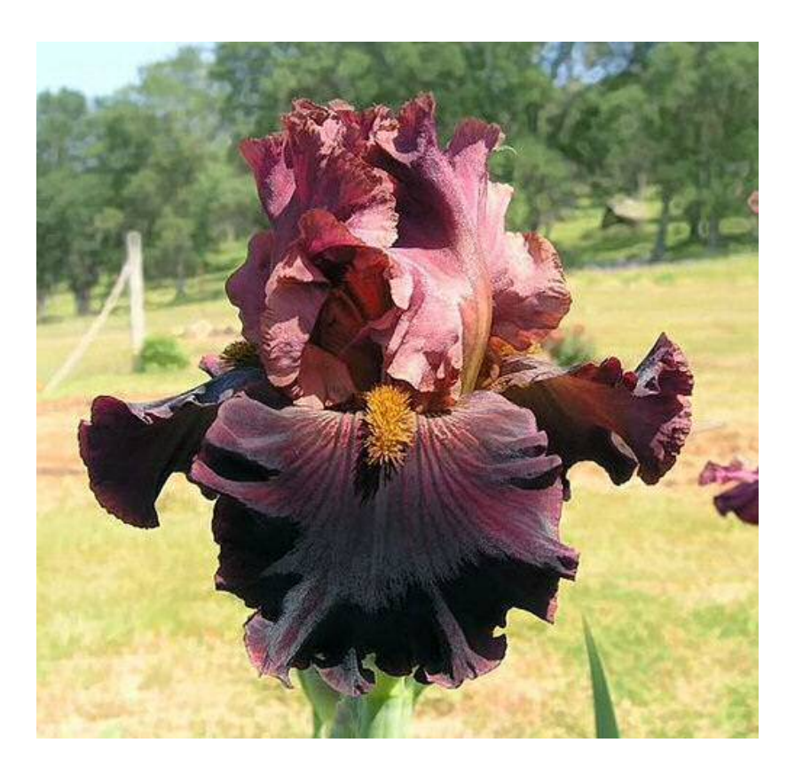
'Smoky Shadows' (Richard Tasco, R. 2010) Adobe brick rose standards. Style arms brick rose. Falls blackish mahogany with deeper veins radiating from copper gold beards. ice'. Superstition Iris Gardens 2010.