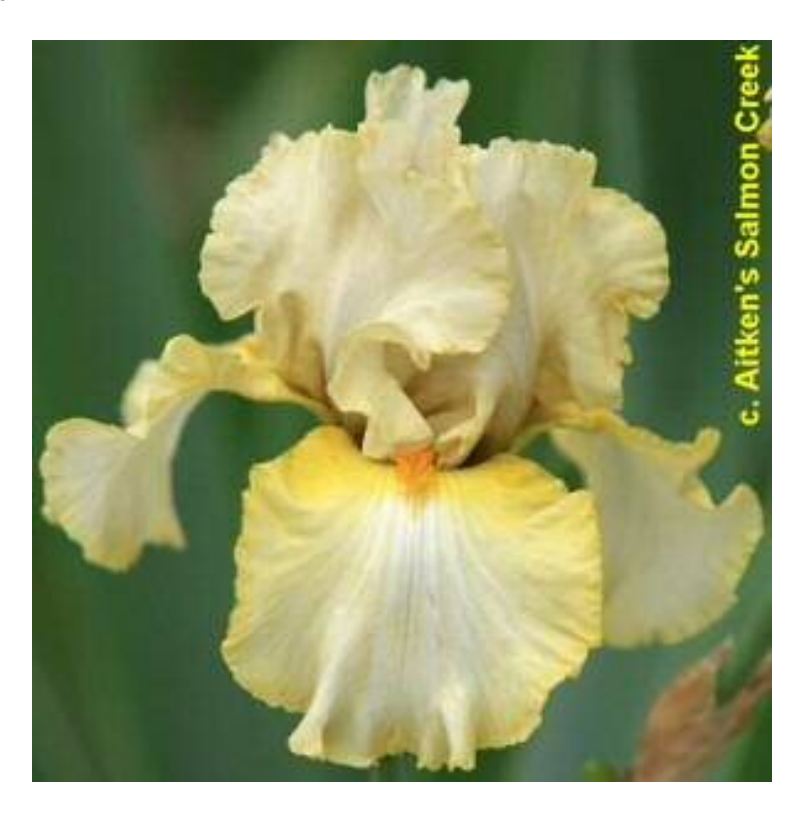
'Other Voices' (Lynn Markham, R. 2004) TB, 34" (86 cm), M. S. green-tinged ivory shading to light gold edges, faint purple flush inside base; style arms greenish cream, gold ribs, edges and crests; F. warm cream tinged green shading to bright gold hafts and petal edges, semi-flaring; beards deep gold; ruffled; slight spicy fragrance. Aitken 2005. Honorable Mention 2008.