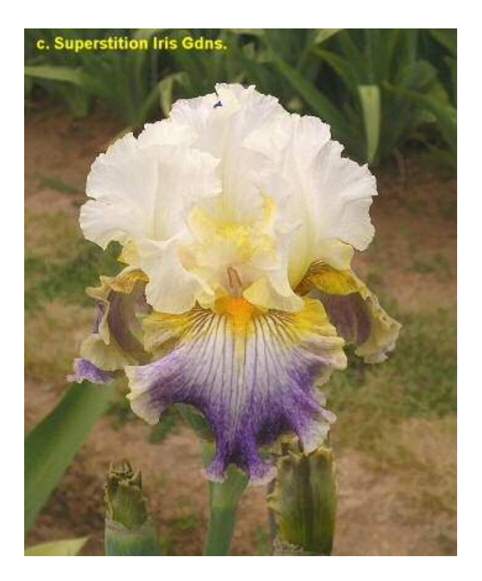
'Quixotic' (Bruce Filardi, R. 2008) TB, 33" (84 cm), ML S. white, small area of aureolin yellow at base; style arms white tipped aureolin yellow, laced; F. white ground almost completely covered in aster violet streaked pattern, lighter in center, narrow light yellow-tan rim, bright aureolin yellow from beard to shoulders; beards cadmium orange; precisely ruffled. International 2010.