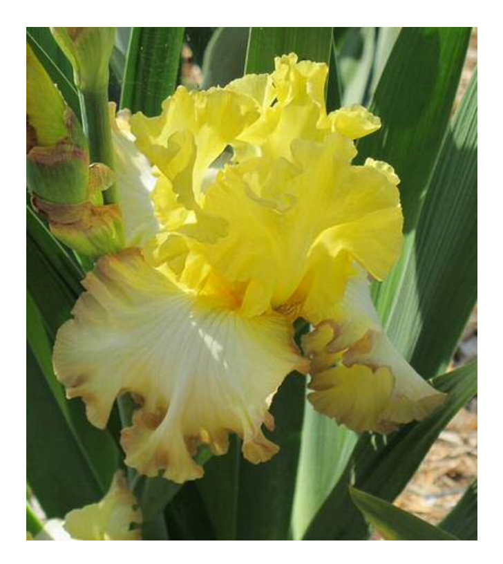
'Autumn Ring' (Michael Sutton, R. 2009). TB, 32" (81 cm), ML & RE. Standards primrose veined white, slight white edge; falls white, with blended red-purple, yellow and brown rim; beards white tipped yellow; ruffled; slight spicy fragrance.