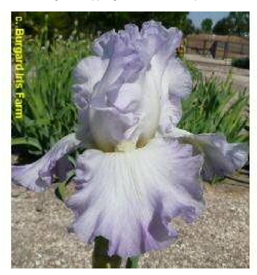
'Stan Coates' (Lesley Painter, R. 2009). TB, 39" (99 cm), EM. Standards white, turquoise blue tint on edges, slight cream to midrib base; style arms light turquoise blue; falls white, lower 2/\hat{a} , f washed turquoise blue veined darker, wash darkest toward edge; beards white, yellow in throat. Napa Country 2010.