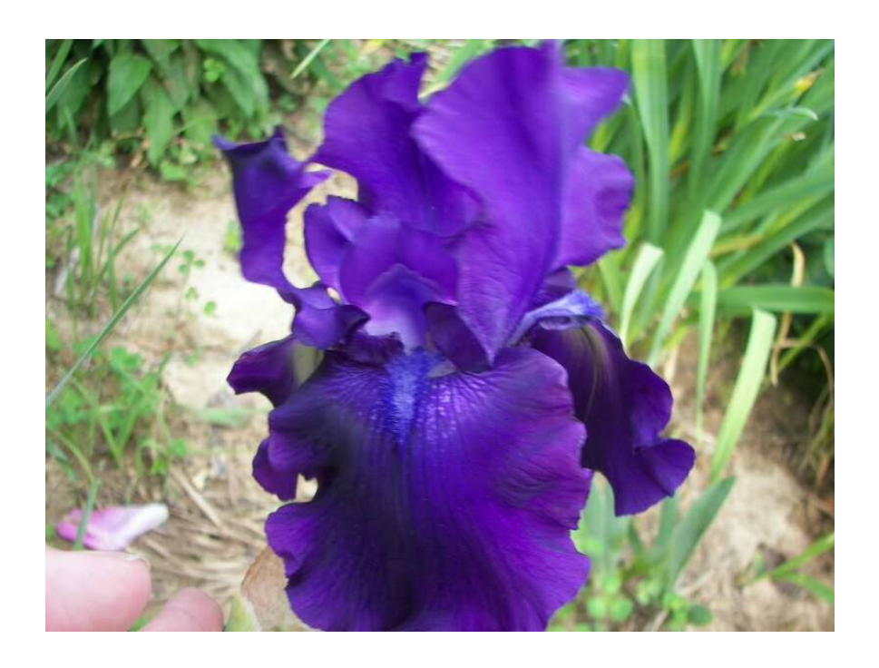
'Trick Of The Light' (Bruce Filardi, R. 2010) TB, 42" (107 cm), Late bloom season. Standards, style arms and Falls bright spectrum violet, dark blue-violet flush in center of petals; beards medium blue; ruffled; slight spicy fragrance. International 2011.