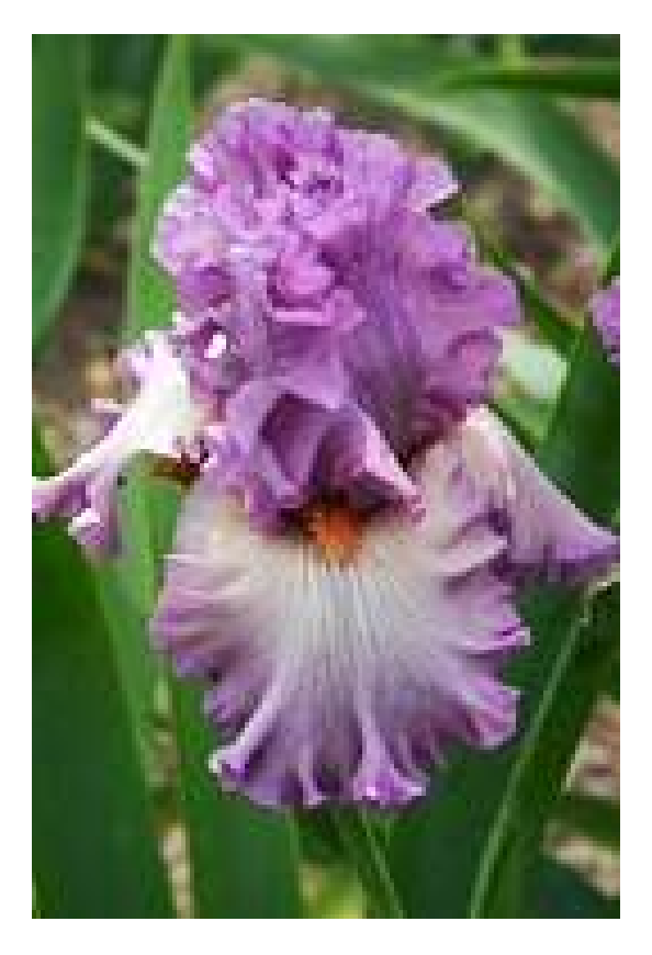
'Edifice' (Joseph Ghio, R. 2008) TB, 36" (91 cm), M S. orchid; F. pinkish orchid becoming deeper orchid at edge; beards tangerine. Bay View 2009. Honorable Mention 2011.