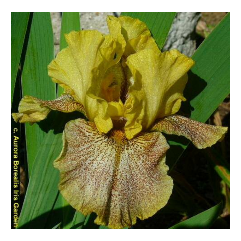
'Magic Quest' (Richard Tasco, R. 2007). BB , height 26" (66 cm), Early to Mid bloom season. Standards and style arms dusky golden yellow; falls light yellow ground heavily dotted burgundy brown, less dotting toward medium yellow rim; beards burnt tangerine faintly tipped burgundy; lightly ruffled; sweet fragrance. Superstition 2007. HM 2011.