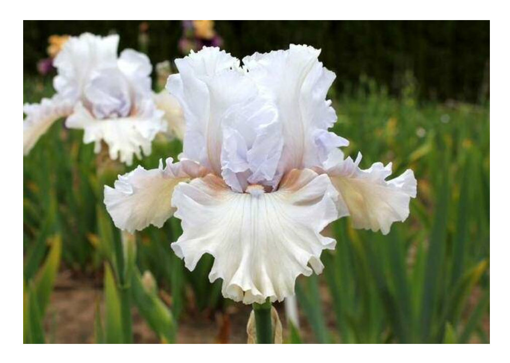
'In The Mix' (Thomas Johnson, R. 2012) TB, 36 (91 cm). Early bloom. Standards and style arms blue white; Falls milk glass-white, pink hafts; beards tangerine, tipped blue white; slight fragrance. Mid-America 2012.

Hybridizer's Comment: Many hybridizers continue to mix pink and blue genes in hopes of producing clear pink and blue irises in various patterns but with a stronger emphasis on blue standards and pink falls. 'In The Mix' helps push that goal forward with the addition of 'Dream Team' which is from a pink and a blue parent and is one of the strongest growing irises in the garden. 'In The Mix' is elegant and superbly formed and is a fine introduction in its own right. Vigorous growth produces stalks having 7-8 buds. Beards are soft tangerine with an icy lavender tip.