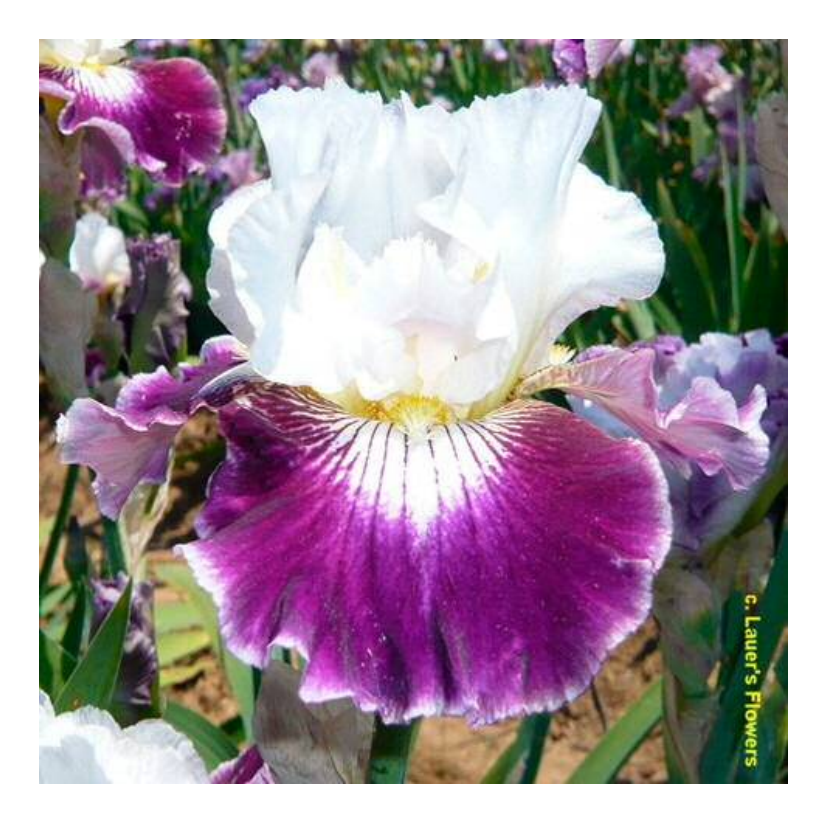
'Carry On' (Larry Lauer, R. 2010) TB, 36" (91 cm), Early, Midseason, late bloom and rebloom. Standards and style arms white; Falls bishop's violet, white rim, brown shoulders, large white area around beard; beards cadmium orange, white at end; ruffled; pronounced sweet fragrance. Lauer 2010.

Hybridizer's Comment: The accent is on BRIGHT! It is the only iris that I can truly say is so bright that up close it is hard to look at. Back away a few feet and it makes a clump that can't be ignored. Bright yellow standards beam above glowing yellow gold falls that are overlaid with mahogany veins becoming dotting and stippling and then banded gold. Nice complement of 8 buds.