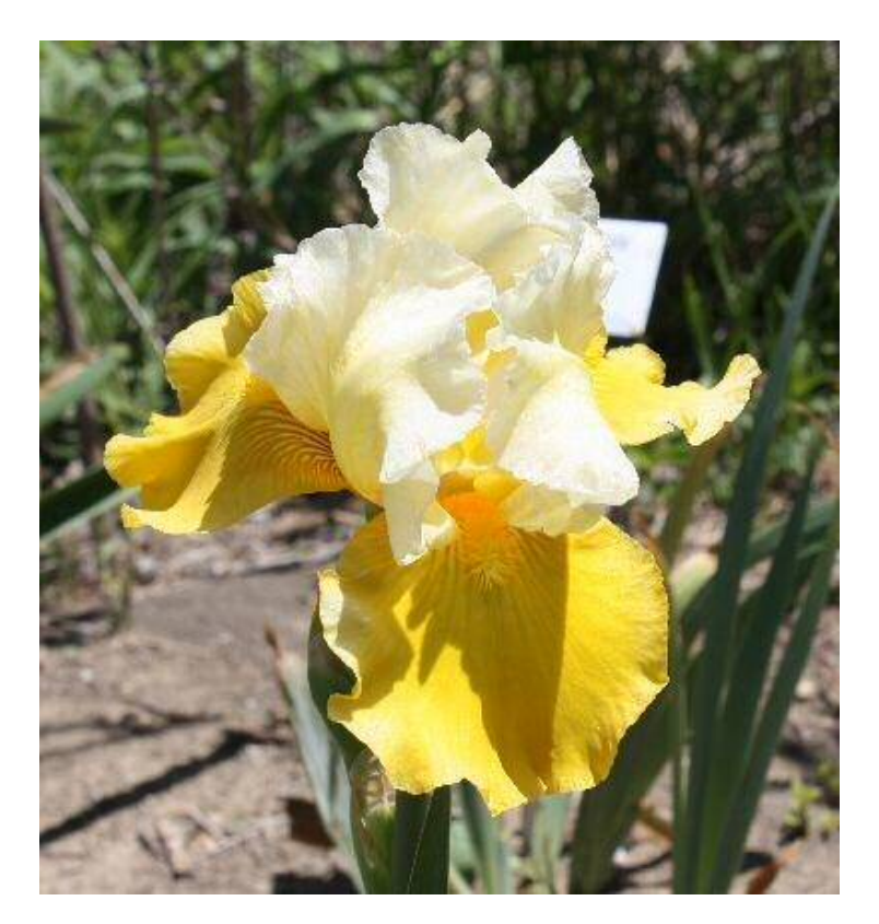
'Winona's Choice' (Cheryl Deaton, R. 2006) TB, 40" (102 cm), M. S. pale yellow, ribs slightly deeper; style arms same, crests deep yellow, elongated; F. deep dandelion yellow, slight white ray pattern around yellow-orange beards; slightly ruffled. Lakeside 2007.