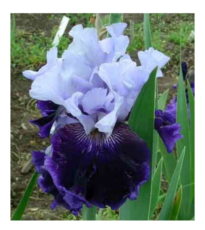
'Aleutian Islands' (Michael Sutton, R. 2007) TB, height 35" (89 cm). Midseason to late bloom. Standards ice white veined blue; style arms violet blue; Falls blue black, lighter edge, white area around bronze yellow beards; slight sweet fragrance. Honorable Mention 2011.