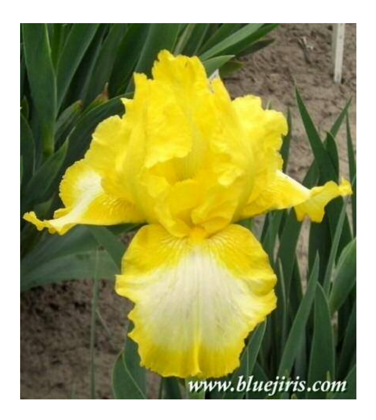
'Bottled Sunshine' (<u>Hooker Nichols</u>, R. 1994). IB , height 22" (56 cm), Early midseason to very late bloom. Standards aureolin; Falls white, deeper aureolin on edge and each side of gold beards; ruffled; pronounced fragrance. Hillcrest 1995. Honorable Mention 1999; <u>Award of Merit 2001</u>; <u>Sass Medal 2003</u>.