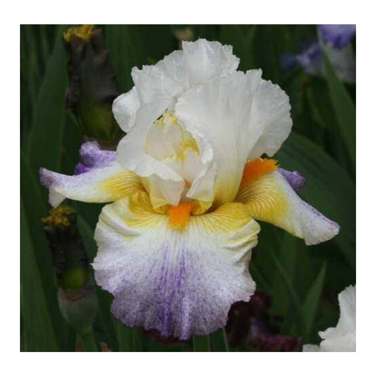
'Arctic Burst' (Roger Duncan, R 2008). TB, 33" (84 cm), Medium season Bloomer. S. cold white; style arms same, light lemon-yellow edge to crest; F. cold white, canary yellow shoulders, lower 2/3 speckled and sometimes lined bishops violet; beards tangerine orange; lightly ruffled; slight fragrance. 2008. Honorable Mention 2010, Award of Merit 2012.