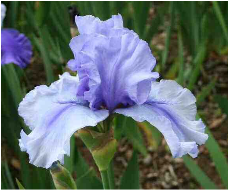
'Bye Bye Blues' (George Sutton). TB , height 37". Midseason bloom. Standards blended hyacinth blue to wisteria blue; style arms pale blue; falls wisteria blue; beards wisteria blue, orange in throat, pale blue base, ending in hyacinth to wisteria spoon; ruffled; slight sweet fragrance. Introduced: Sutton 1997. Space Ager .