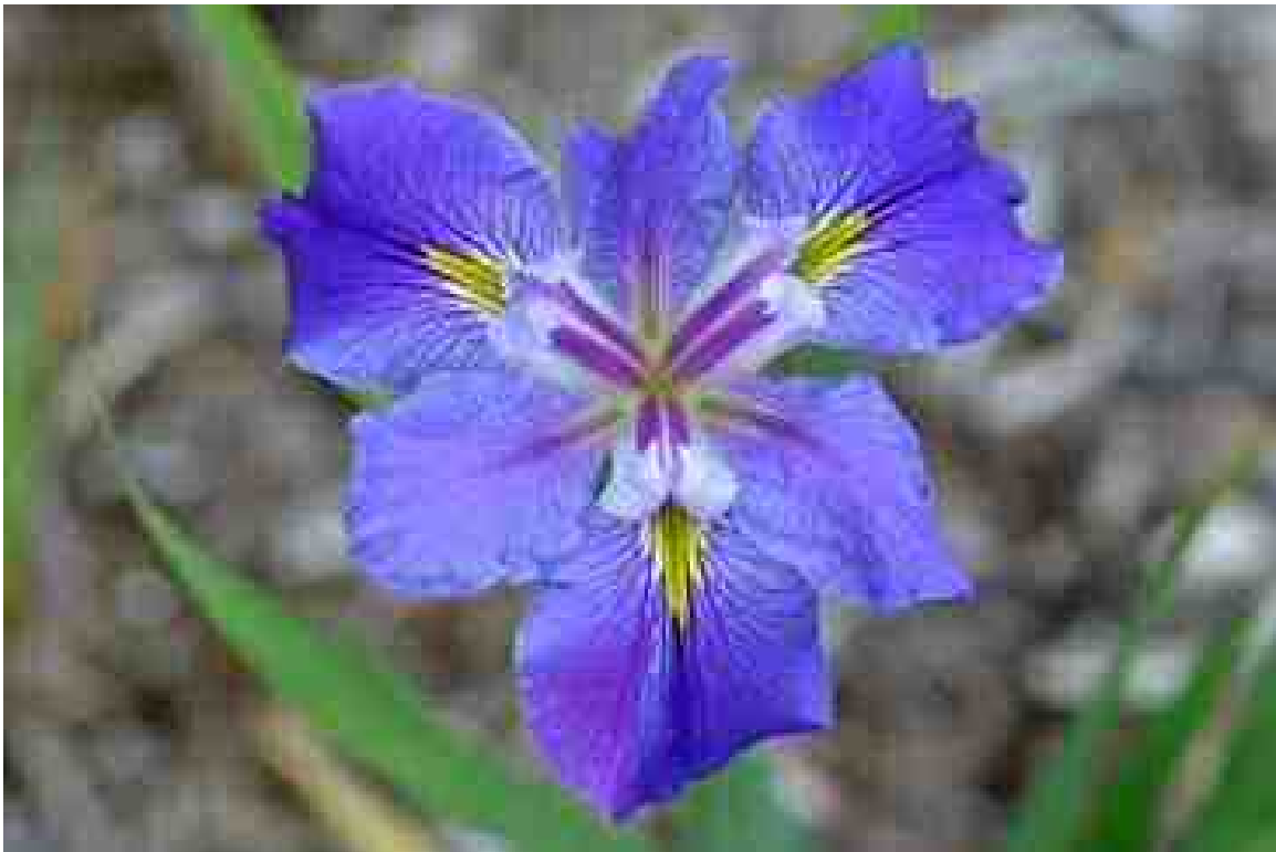
' Ocean Fisher ' (T. J. Betts). LA, height 43", Late bloom. Lightly ruffled blue, veined. Falls with pale rim green streak with lime burst signal; style arms purple, pale reflexed lacy crests. Introduced: Iris City 2007. AIS Award: Honorable Mention 2012.