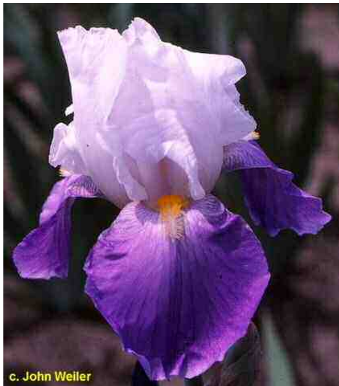
' Orchid Cloud ' (Charles Applegate). TB , height 35", Early midseason bloom and rebloom. Standards pure white; Falls orchid with blue blend overlay on edge; gold beard tipped lighter. Introduced: Summerlong 1974. Historic. Rebloomer.