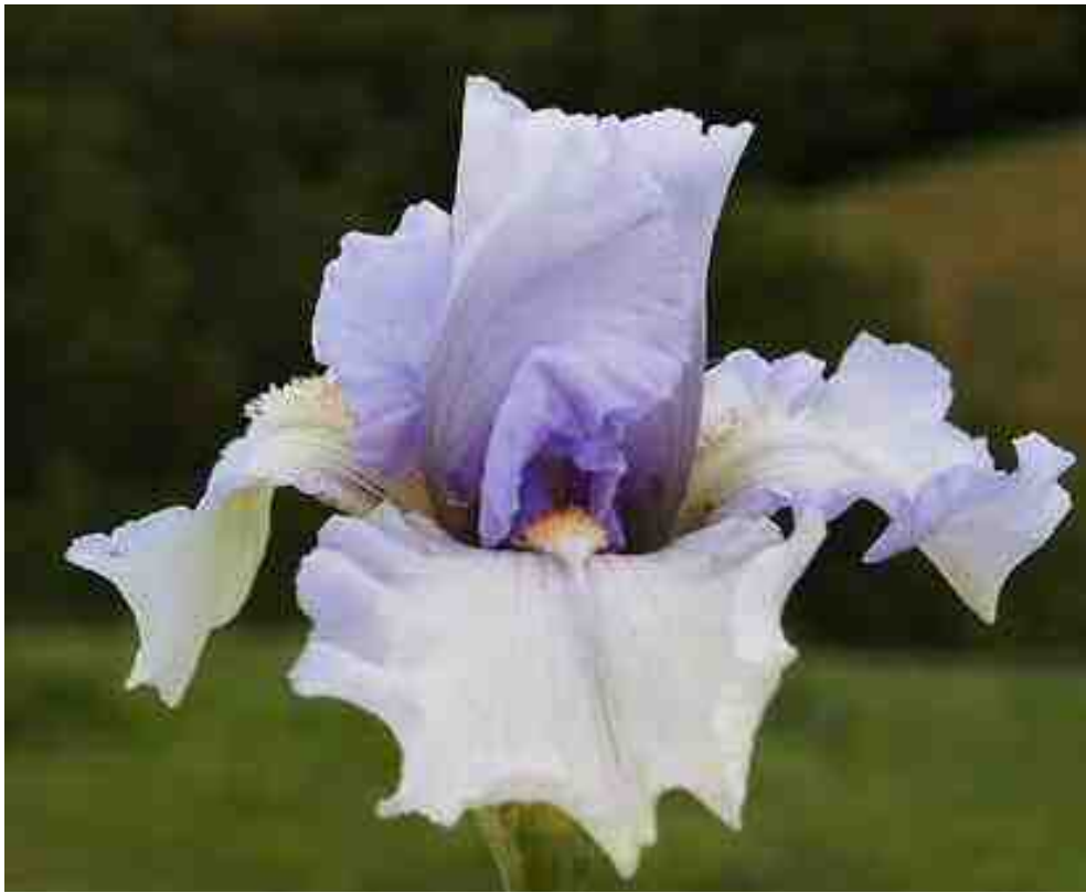
' All American ' (Monty Byers). TB , height 31", Midseason bloom and rebloom. Standards light blue; Falls glacial white; beards bright red; pronounced sweet fragrance. Introduced: Moonshine 1992. Rebloomer .