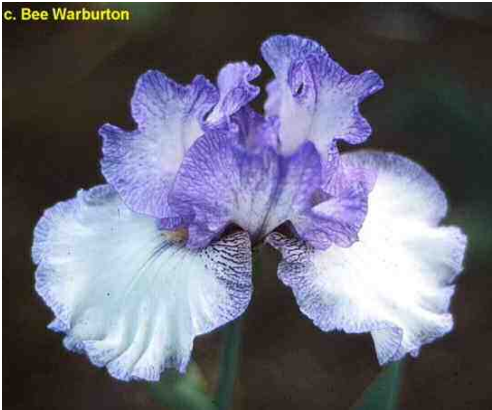
' Sterling Stitch ' (Sterling Innerst). TB , height 36", Midseason bloom. White, trimmed blue; tangerine beard. Introduced: Innerst 1984. AIS Award : Honorable Mention 1987. Historic .