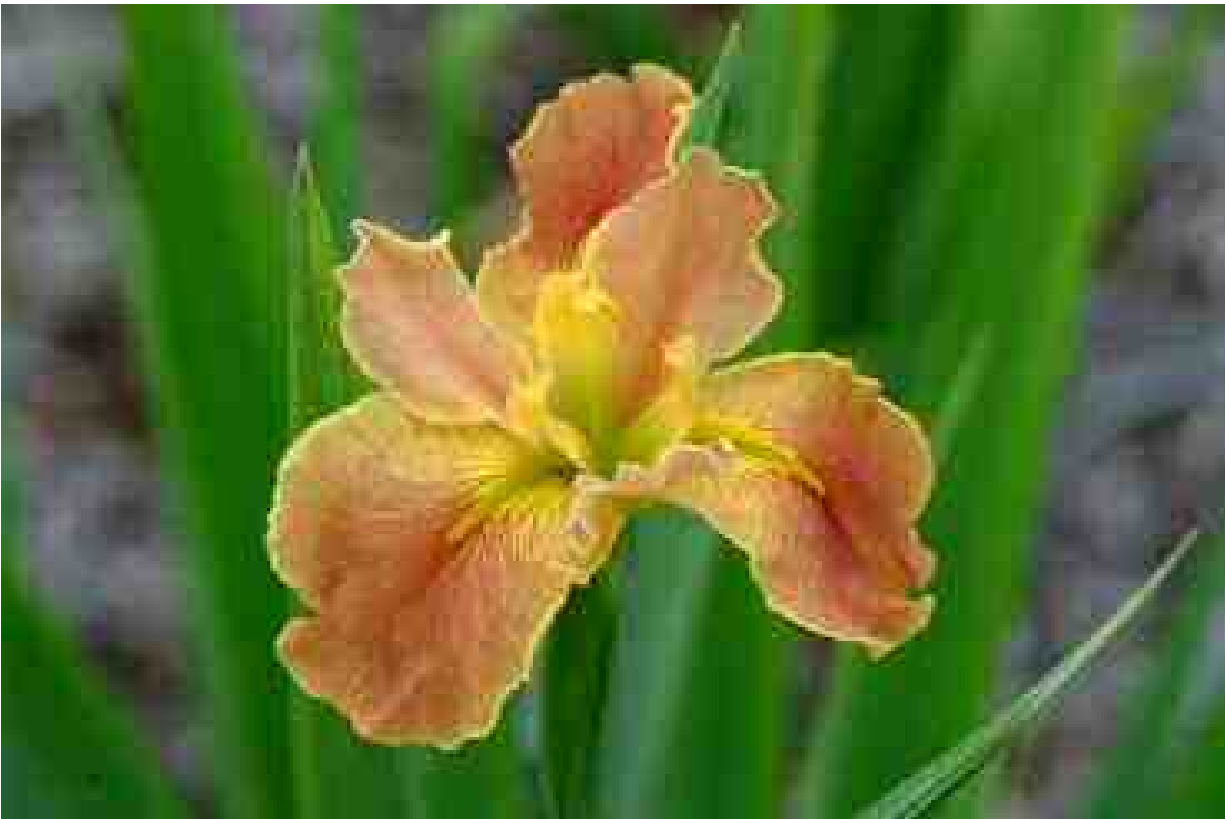
' Melon Cocktail ' (T. J. Betts). LA, height 35", Midseason bloom. Standards light spanish orange; style arms pale green; Falls greyed rose, yellow rim and reverse, yellow burst signal with green ridge; lightly ruffled. Introduced: Iris City 2006.