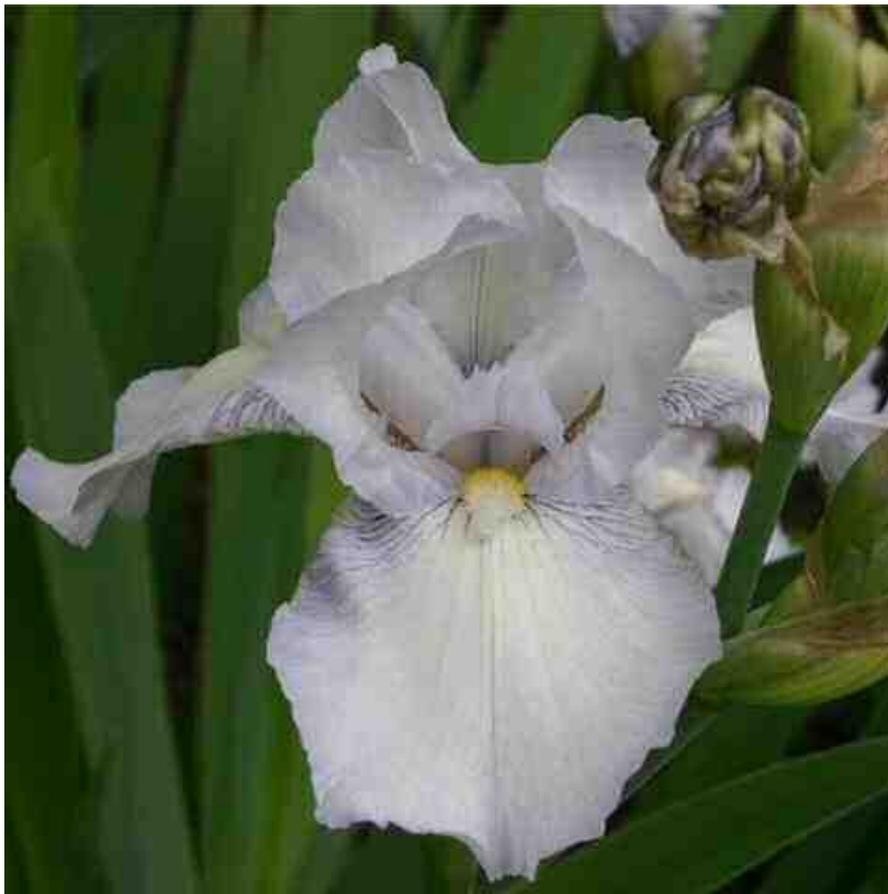
' English Cottage ' (Lloyd Zurbrigg). TB, height 34", Early bloom and rebloom. Standards white with some very pale plicating of violet; Falls white, light violet plicata markings at haft only; near white beard. Introduced: Avonbank 1976. Historic. Rebloomer.