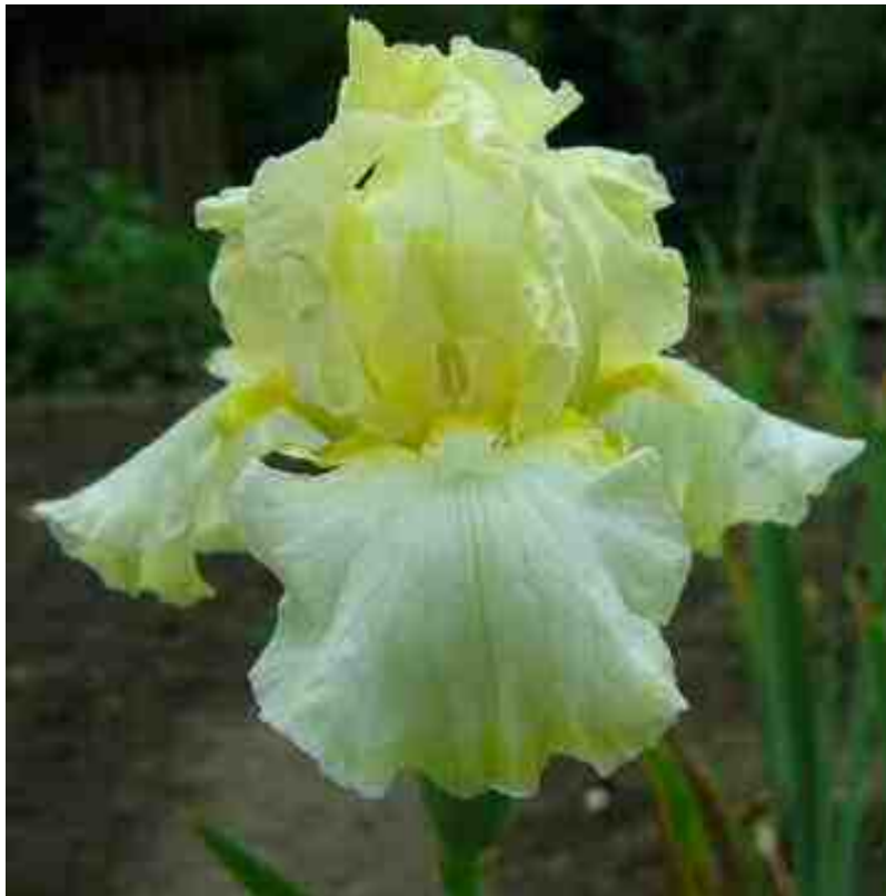
' Goddess Of Yellow ' (O. David Niswonger). IB , height 25". Midseason bloom. Standards and style arms light yellow; Falls white, hafts yellow; beards white, hairs tipped yellow. Introduced: Cape Iris 2000.