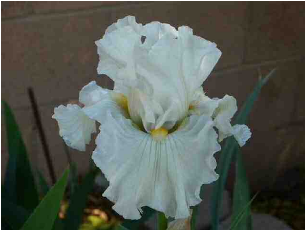
'Lunar Whitewash' (Sterling Innerst) TB , height 36", Mid Late bloom season & rebloomer. White self; style arms and beards cream. Introduced: Innerst 2003. Rebloomer .