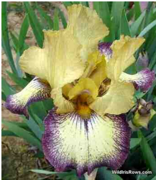
' Tennessee Gentleman ' (Sterling Innerst). TB , height 36", Midseason to late bloom. Medium yellow with 1/2" blue purple trim on falls; bronze blue beard. Introduced: Innerst 1991.