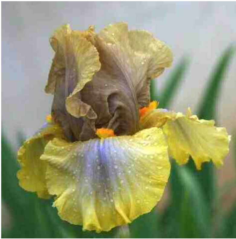
' Baditude ' ( Tom Burseen ). TB , height 36", Midseason bloom. Standards yellow gold, brownish purple infusion; style arms bright golden lemon yellow; Falls chrome yellow, cream lavender flash below golden lemon beard; ruffled; spicy fragrance. Registered by Tom Burseen 2000. [Introduction date not listed.]