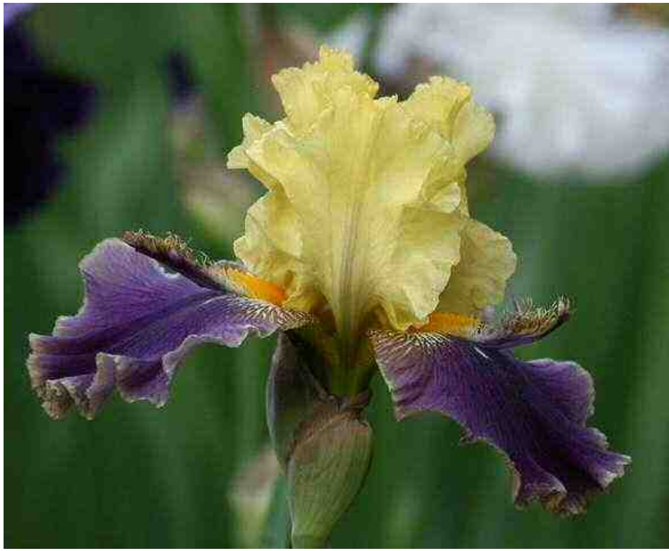
' Jeremy Jets On ' (Tom Burseen). TB , height 35", mid season bloom. Standards and style arms bronze yellow; Falls hazelnut brown overlaid blue, light tan edges, round; Beards gold, large tattered golden-brown flounces; very flared and ruffled; slight fragrance. Introduced: Burseen 2006. Space Ager .