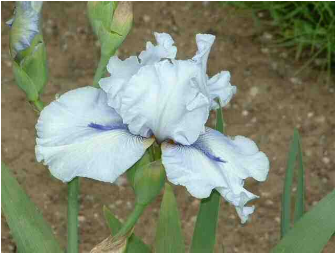
' Ty Blue ' (Tom Burseen). TB , height 35", Medium season bloomer. Ruffled pale lavender, falls sometimes splotched violet; beards white, hairs tipped tangerine, purple horn; flared; sweet fragrance. Introduced: TB's Place 2000. Space Ager .