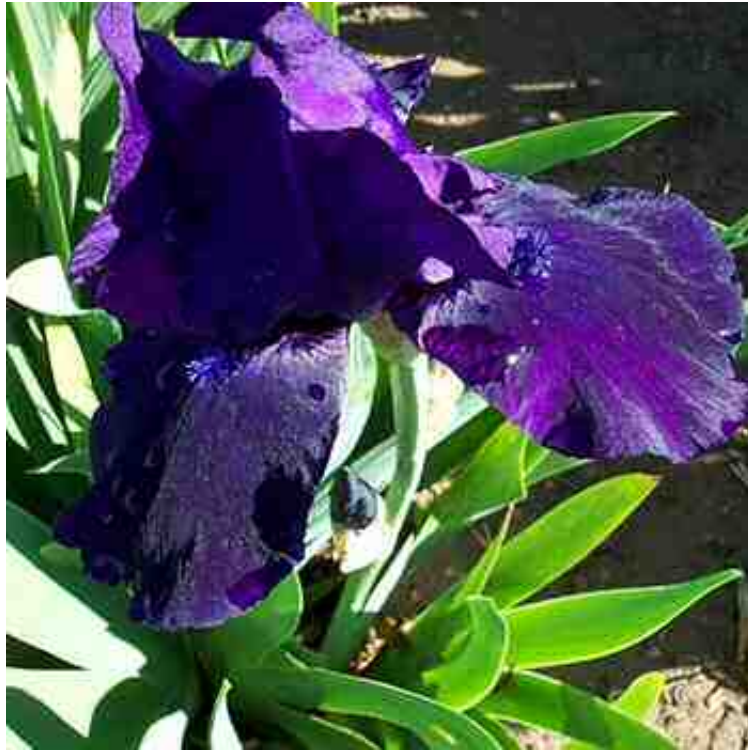
' Kentucky Coal ' (George Slade). TB , height 34", Midseason bloom. Dark blue black with sooty overlay; dark blue black beard. Introduced: Slade's Iris 1985. Historic .