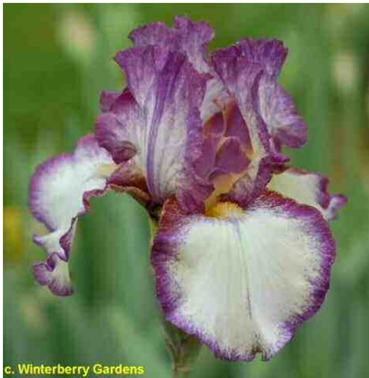
' Say Okay ' (Tom Burseen). TB , height 36", Early bloom. Standards creamy white ground washed violet blue; falls creamy white ground, precise violet blue stitched band; beards yellow, tipped white; ruffled; sweet fragrance. Introduced: TB's Place 1991. Rebloomer .