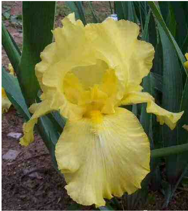
' Corn Harvest ' (Carl Wyatt). TB, height 30". Early to midseason bloom and rebloom. Full yellow self; ruffled Falls; full yellow beard. Introduced: Melrose Gardens 1977. Historic. Rebloomer.