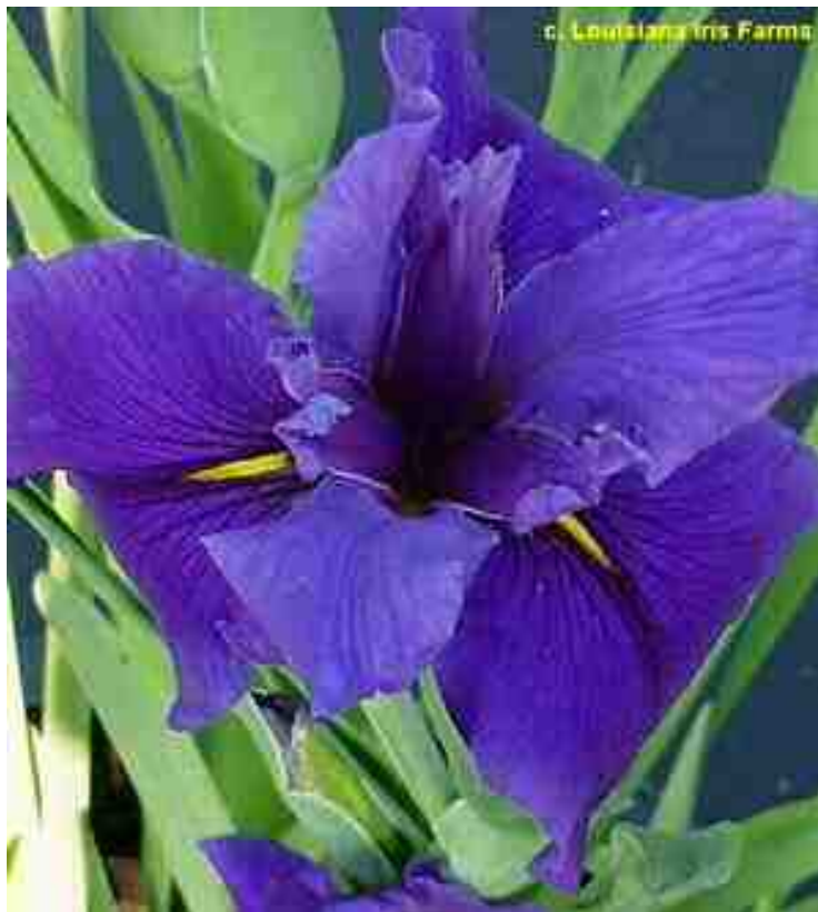
' Sea Knight ' (R. Morgan). LA, height 20-25", Early, mid bloom. Very dark blue; orange line signal. Introduced: Bois d'Arc Gardens 1989.