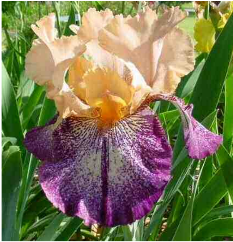
'Kid's Clothes' (Tom Burseen). TB , height 34". Midseason to late bloom. Standards tannish orange, serrate; Falls white ground with red purple speckling more concentrated toward red purple edge; beards mustard, tipped orange; ruffled; musky fragrance. Introduced: TB's Place 1994.