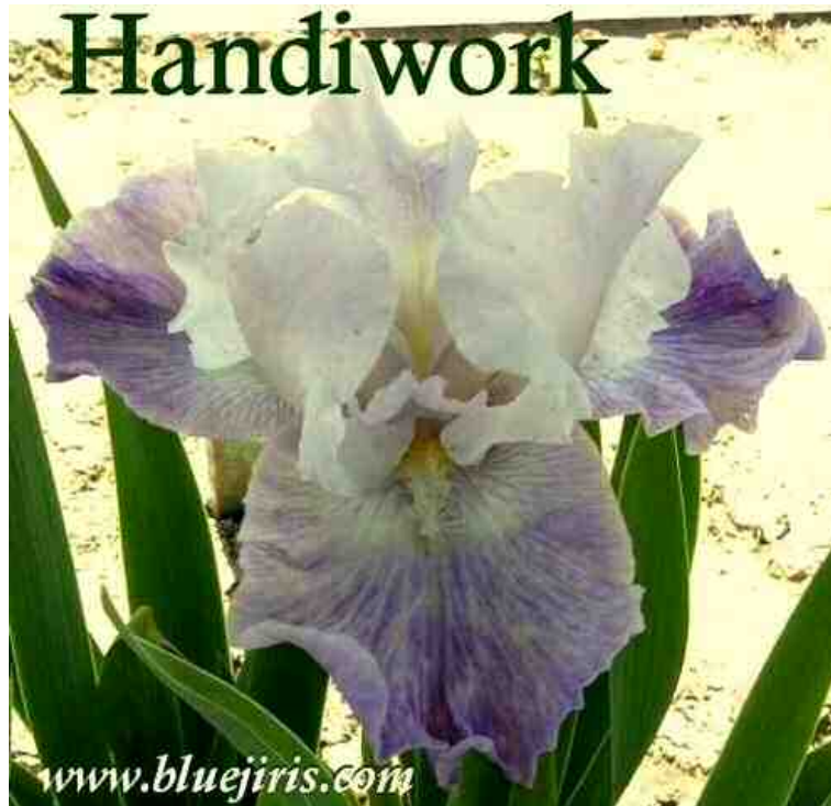
' Handiwork ' (Joseph Ghio) TB, height 34", Mid to late bloom. Standards blue violet over white ground; Falls white ground, marbled blue violet, white area around blue white beard. Introduced: Bay View Gardens 1983. AIS Award: Honorable Mention 1985. Historic.