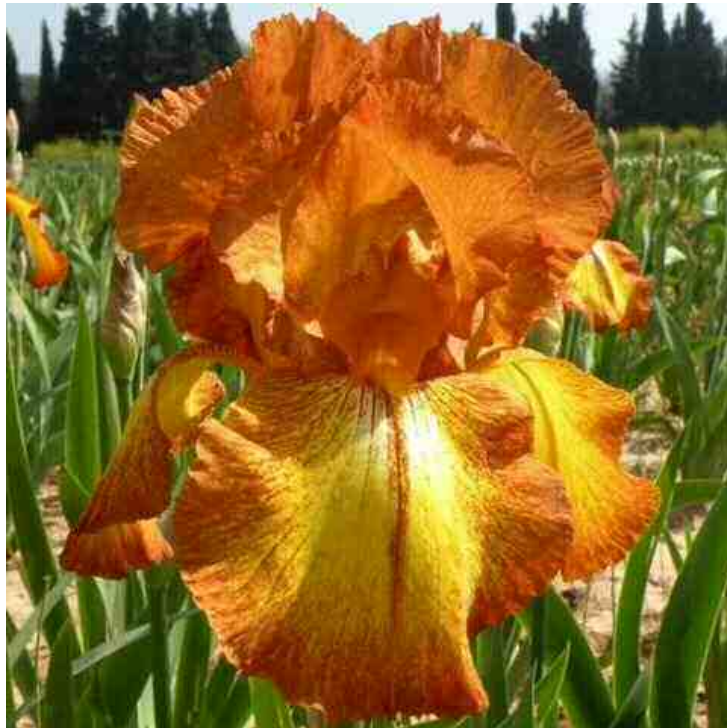
' Autumn Echo ' (James Gibson). TB , height 36", Early & rebloomer. Standards yellow ground speckled garnet brown, garnet brown rim flushed yellow; Falls canary yellow ground speckled garnet brown, garnet brown rim, small white signal at tip of tangerine orange beard. Introduced: Gibson 1975. AIS Award : Honorable Mention 1977. Rebloomer .