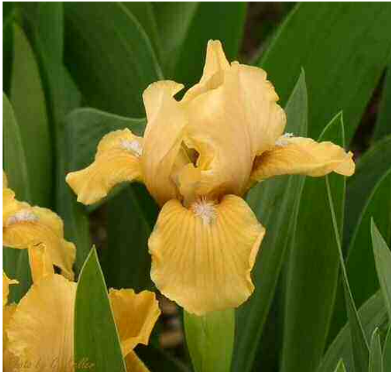
' Sugar Maple ' (George Sutton). SDB , height 12", very early to early mid season bloom and rebloom. Standards apricot, midrib blushed violet; falls orange buff veined tangerine orange; beards burnt orange, pale blue base; ruffled; pronounced sweet fragrance. Introduced: Sutton 2003. Rebloomer .