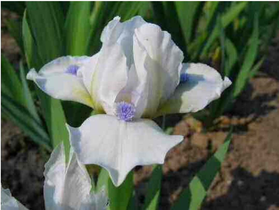
' Star Of Africa ' (Perry Dyer). SDB , height 14", Early midseason bloom. Light chicory blue self; beards medium sapphire blue. Introduced: Contemporary 1999. AIS Awards : Honorable Mention 2001; Award of Merit 2005.