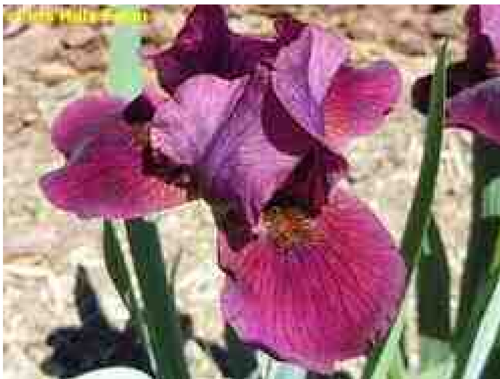
' Red Rabbit ' (Donald Spoon). SDB, height 10", early to mid season bloom. Deep red with bluish cast, falls with red spot; beards deep bluish red; ruffled. Introduced: Winterberry 2002.