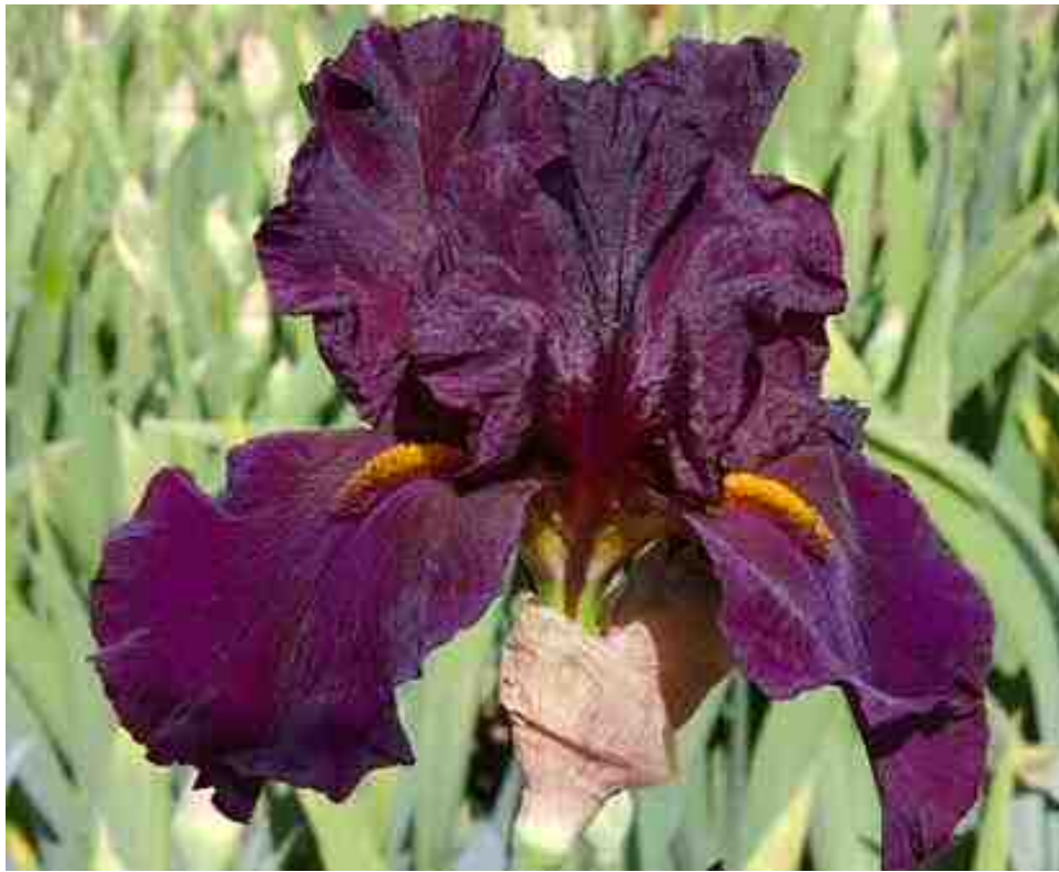
' Men In Black ' ( Larry Lauer). TB , height 34", Midseason late bloom. Ruffled blackish purple, Falls with deep lavender central flush; beards deep purple, hairs tipped mustard, changing to mustard central section, bright yellow in throat; slight sweet fragrance. Introduced: Stockton 1998.