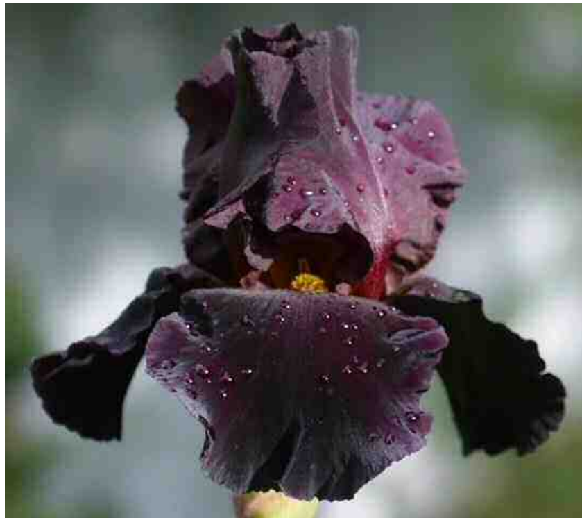
' Black As Night ' (Duane Meek). TB , height 37". Midseason late bloom. Standards red black, flushed red at midrib; Falls darker; beards black, tipped brown mustard; ruffled; slight fragrance. Introduced: D. & J. Gardens 1992.