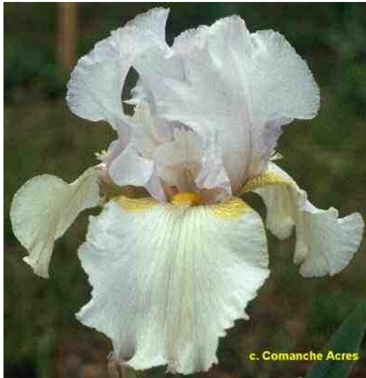
'High Ho Silver' (Monty Byers). TB , height 36", early to midseason bloom and rebloom. Lightly ruffled silvery grey to silver white, tan gold hafts; light ground beard tipped gold; slight musky fragrance. Introduced: Moonshine Gardens 1989. Rebloomer.