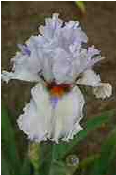
'Christine Suchy' ( Tom Burseen). TB , height 37", Early to midseason bloom. Standards very pale lilac; style arms same washed pink; Falls lighter; beards rose pink, fuzzy lilac-purple horns; very ruffled; sweet fragrance. Introduced: Burseen 2006. Space Ager .