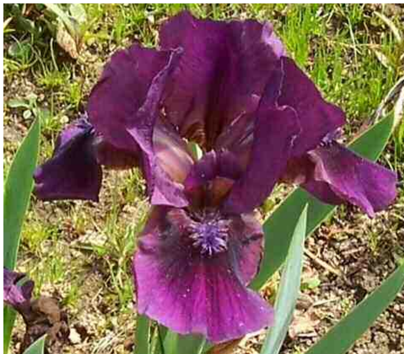
' Bloodspot ' (Tim Craig). SDB , height 2 1/2" to 10 1/2", Extra early bloom season. Arabian red self with zanzibar spot pattern on Falls. Introduced: Craig 1966. AIS Awards : Honorable Mention 1969; Judges Choice 1969, 1970; Award of Merit 1972. Historic .