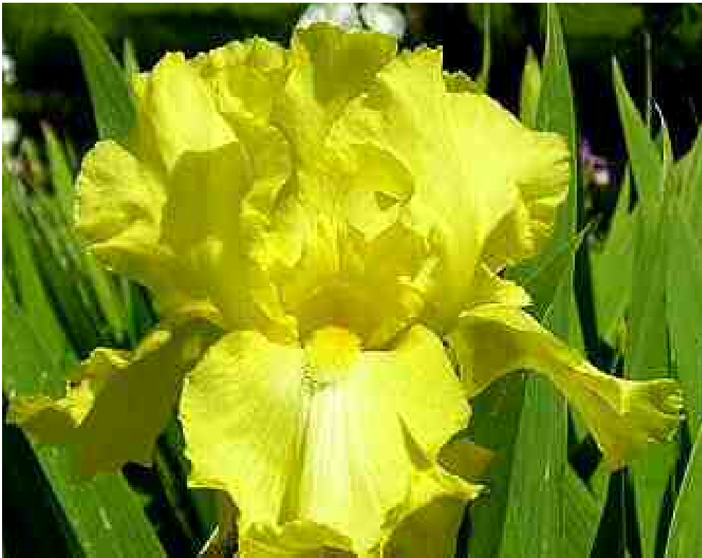
'Harvest Of Memories' (Lloyd Zurbrigg). TB , height 38". Midseason bloom and rebloom. Dresden yellow; yellow beard; slight sweet fragrance. Introduced: Avonbank Gardens 1985. Historic. Rebloomer.