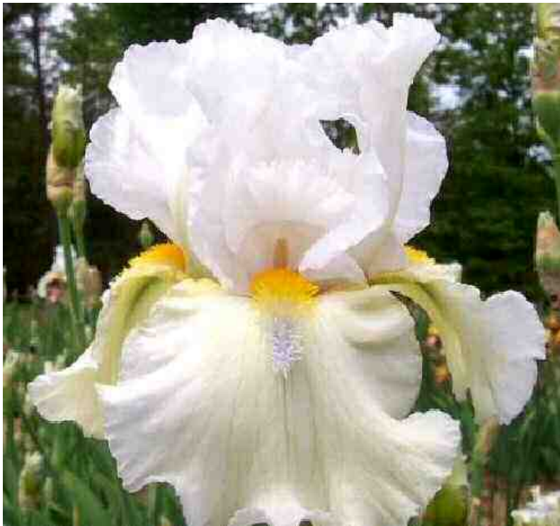
'Howdy Do' (Monty Byers). TB , height 35". Early to late bloom. Ruffled silver white, faint yellow glow at hafts; blue white beard tipped cadmium orange, 1" blue horns. Introduced: Moonshine Gardens 1986. Space Ager.