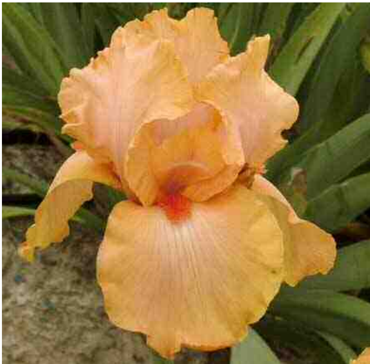
' Robusto ' (Paul Black). TB , height 36", Late mid season bloom. Standards apricot with peach pink infusion up midrib; Falls apricot pink; tangerine beard. Introduced: Mid-America Gardens 1984. Historic.