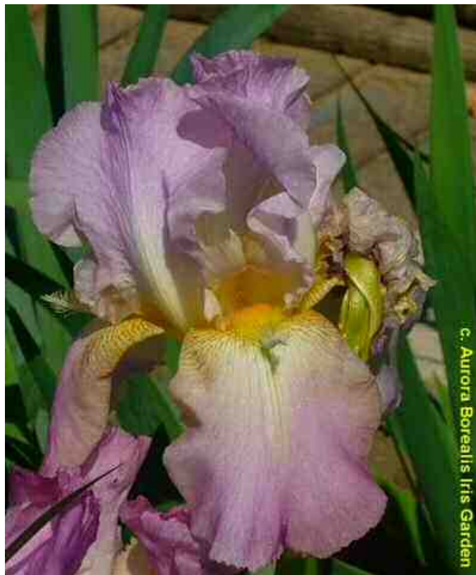
'Horned Tangerine' (Lloyd Austin). TB , height 34". Late bloom. Standards light pink; Falls bordered light pink, flushed pinkish-lavender; horned, tangerine beard. Introduced: Rainbow 1960. Historic. Space Ager.