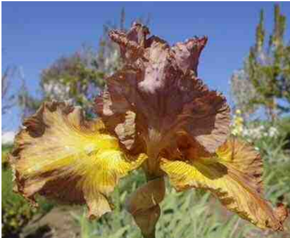
'Destry Rides Again' (Richard Gibson). TB , height 32", Early midseason bloom and rebloom. Standards brown; style arms yellowish brown; Falls yellow, tinged brown; beards yellow; ruffled. Introduced: Stockton 1995. Rebloomer .