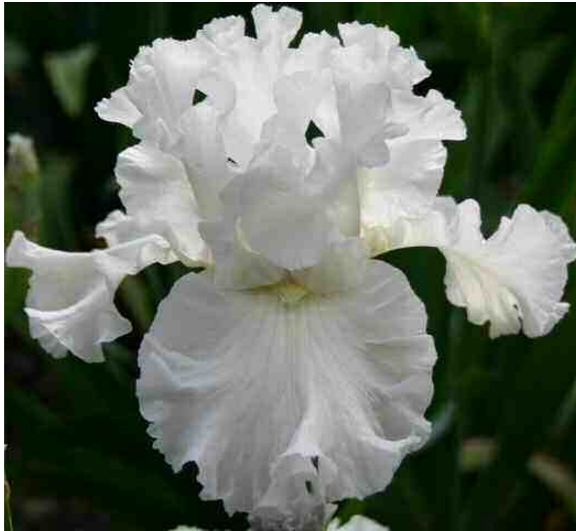
' Skating Party ' (Larry Gaulter). TB , height 34". Midseason to late bloom. Fluted white; lemon beard tipped white. Introduced: Cooley's Gardens 1983. Historic .