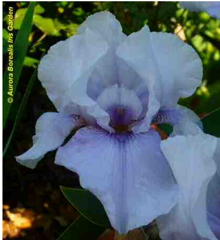
'Elegant Blue' (Paul Blyth). TB , height 34-36", Midseason to late bloom. Powder blue, slightly deeper overlay on Falls, brownish hafts; navy blue beard tipped bronze. Introduced: Tempo Two 1989/90.