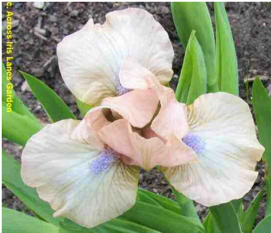
' Ahwahnee Princess ' (George Sutton). SDB , height 12", Early mid bloom season & reblooming. Standards and style arms rhodonite red; falls pale orient pink; beards wistaria blue, soft orange in throat; ruffled; slight sweet fragrance. Introduced: Sutton 2004. Rebloomer .