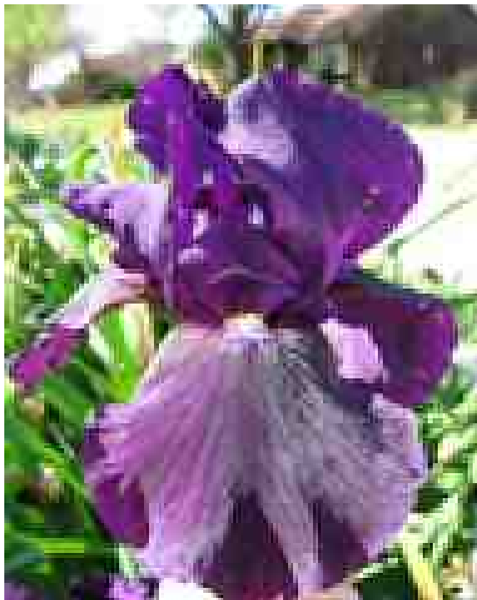
' Baldwin's Ace ' (Tim Craig). IB , height 24", Extra Early bloom season. Sable black-violet self. Introduced: Craig 1966. Historic .