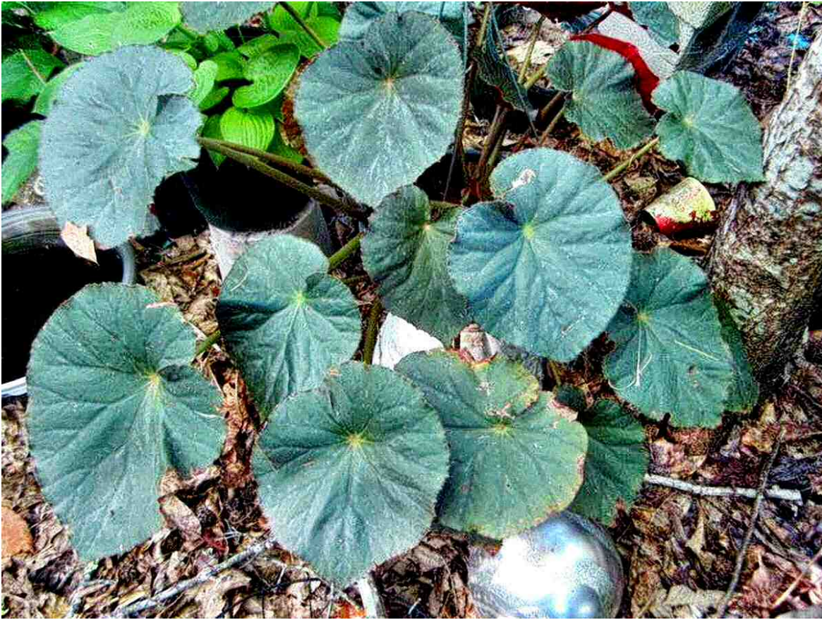
B. U484 -Freda Holley