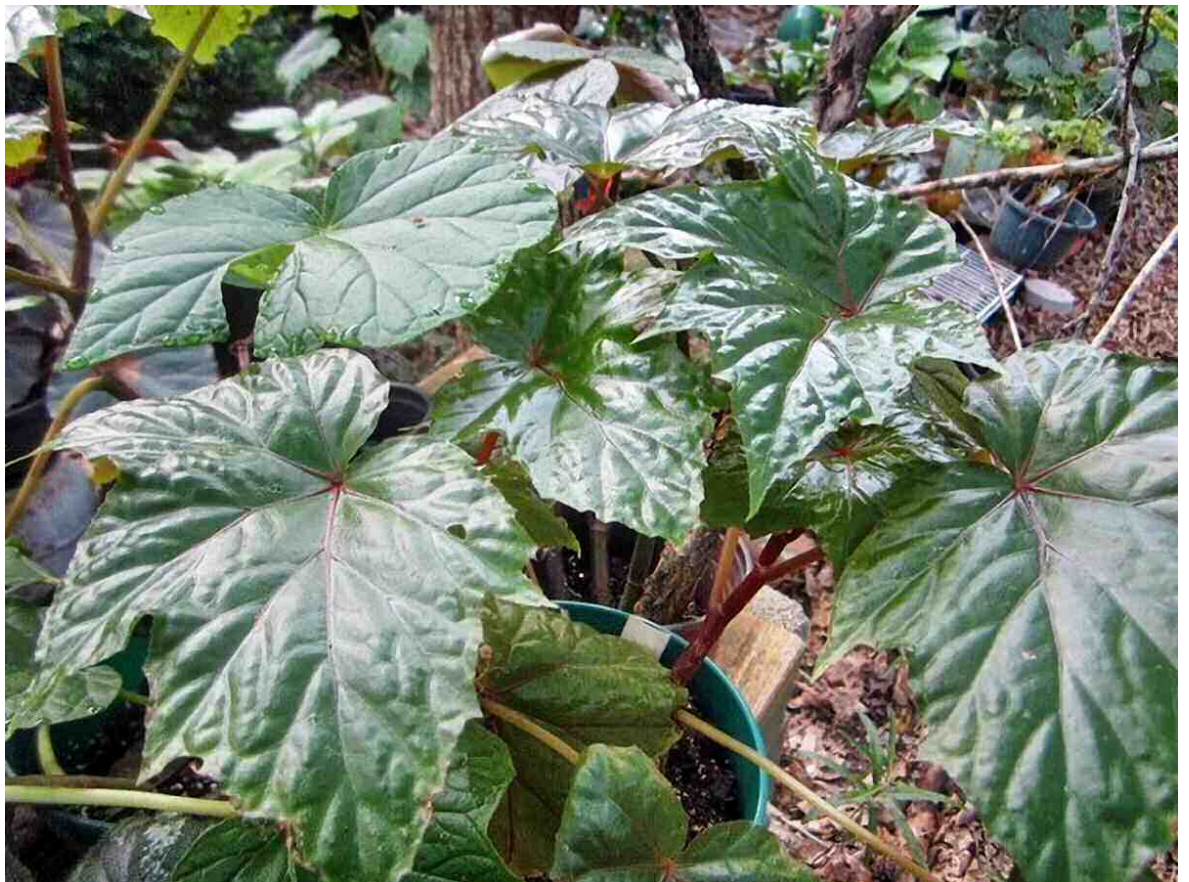
B. oxyloba - Freda Holley