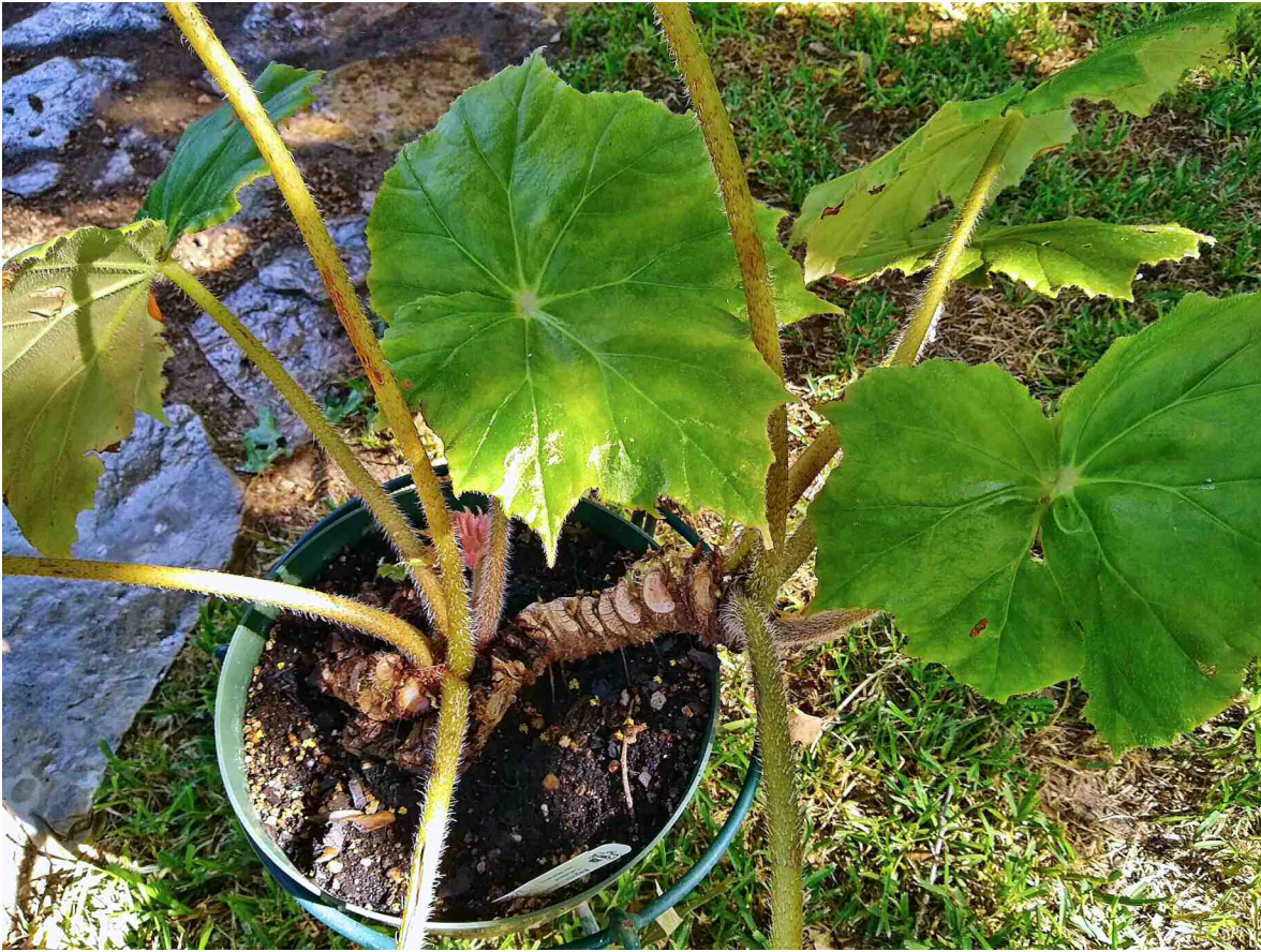
B. 'Lotusland' - Doug Byrom