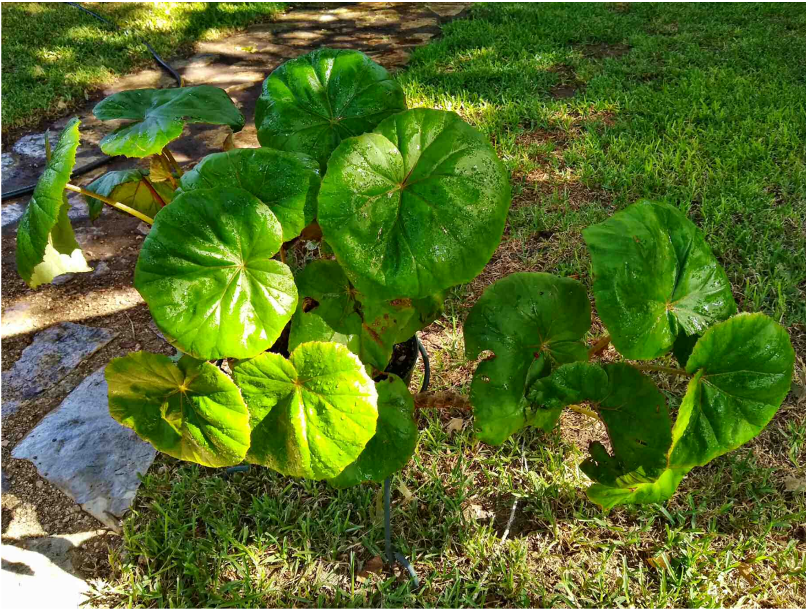
B. U331 - Doug Byrom