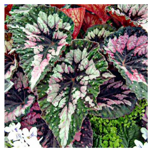
B. 'Merry Christmas'