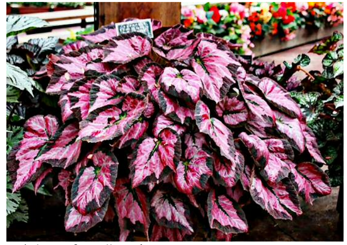
B. 'Glory of St Albans'