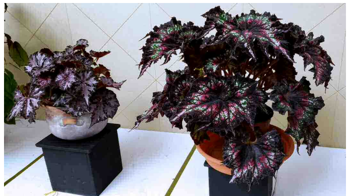
B. 'Dejah Thoris' and B. 'Phantom'