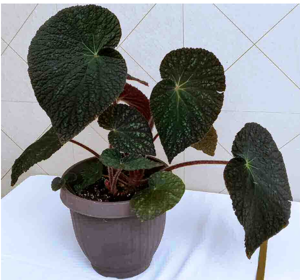
B. 'Emerald of Siam'

Freda Holley showed B. 'Emerald of Siam,' a rhizome jointed at below soil with erect stem.