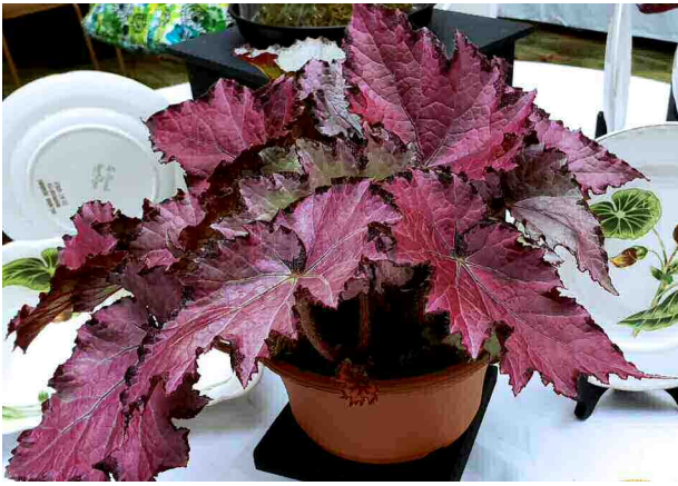
B. 'Champagne Bubbles'