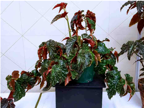
B. 'Mrs. Miller'