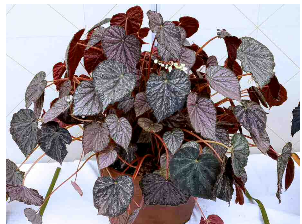
B. 'Passing Storm'