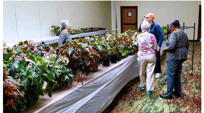
Getting ready for the sale