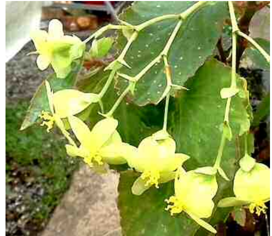
B. 'Mello Yellow'