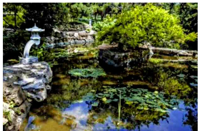
The lowest pond of the Taniguchi Garden

Water the begonias before you fertilize them weekly and weakly. Grow them like Show Plants. Clean the container by using a small amount of vegetable oil and replant the begonia in some good potting soil. Remove dead leaves and flowers while checking the foliage for insects. Continue to do this until you examine the plant to take to the show in May.