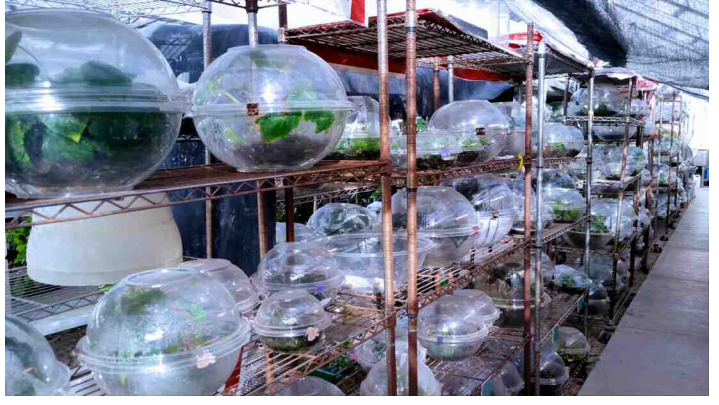
Terrarium Collection at the Species Bank