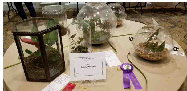
Entries at the 2018 ABS-SWR Convention in NOLA.

AABS WEBSITE http://www.kenfuchs42.net/aabs_index.html