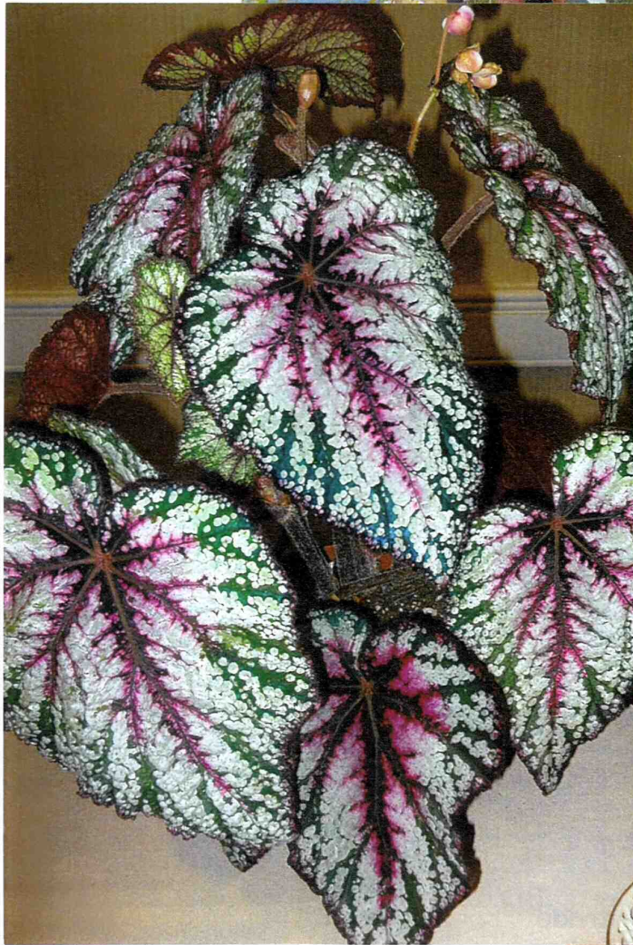
Begonia 'My Good Friend' FIRST PLACE SWR Show in New Orleans Doug Pridgen