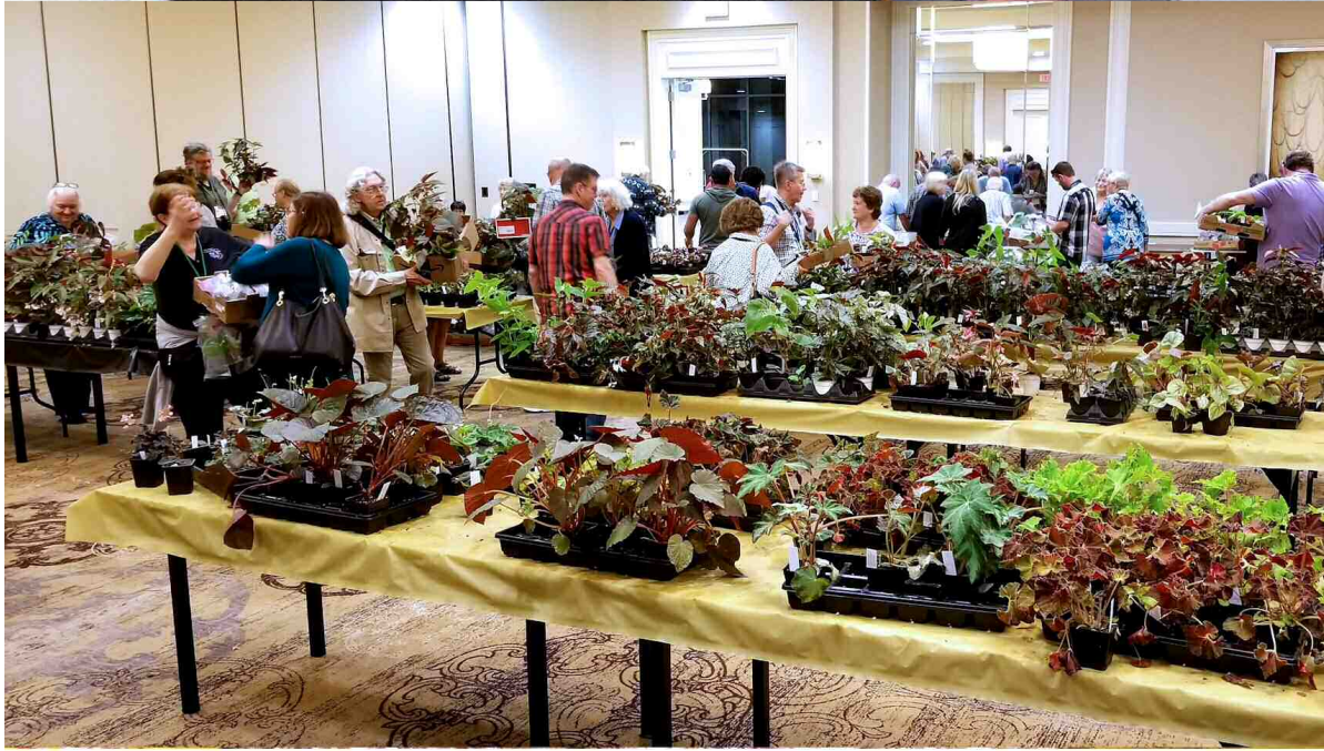
PLANT SALE ROOM