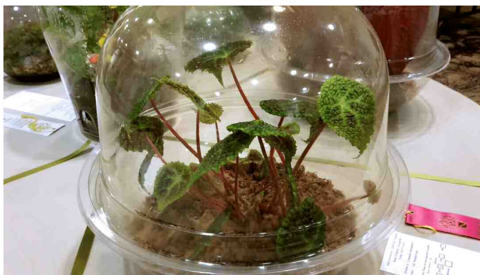
B. microsperma x staudtii