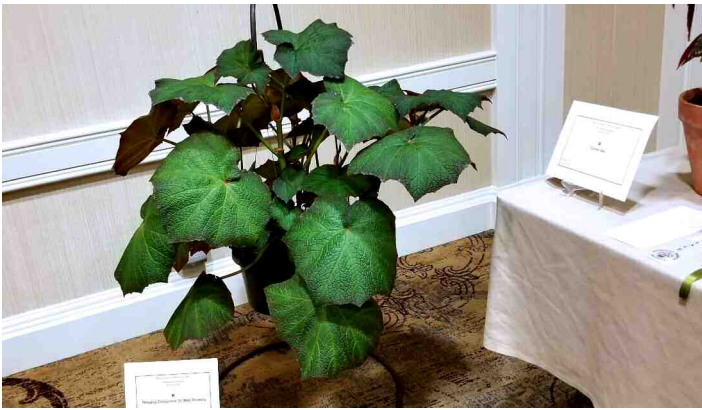
Hanging Containers or Wall Pockets - Cindy Moran