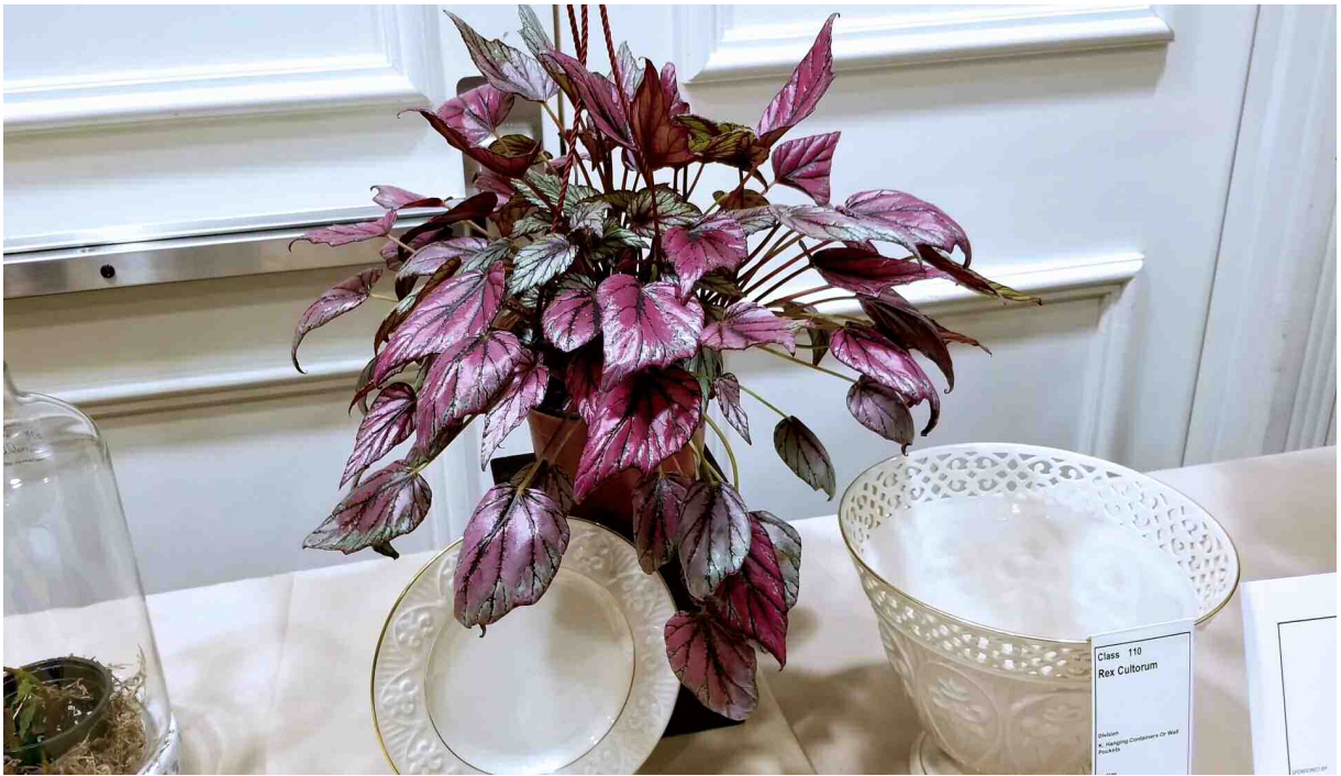
BEST OF SHOW – B. 'Hugh McLaughlin' (Rex Cultorum) – Doug Pridgen