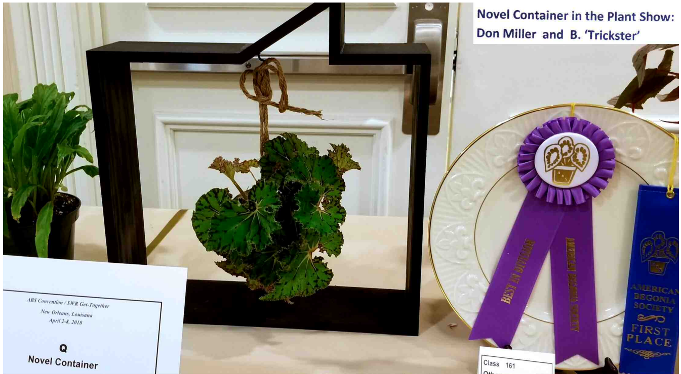
Novel Container in the Plant Show: Don Miller and B. 'Trickster'

ABS Convention / SWR Get-Together New Orleans, Louisiana April 2-8, 2018