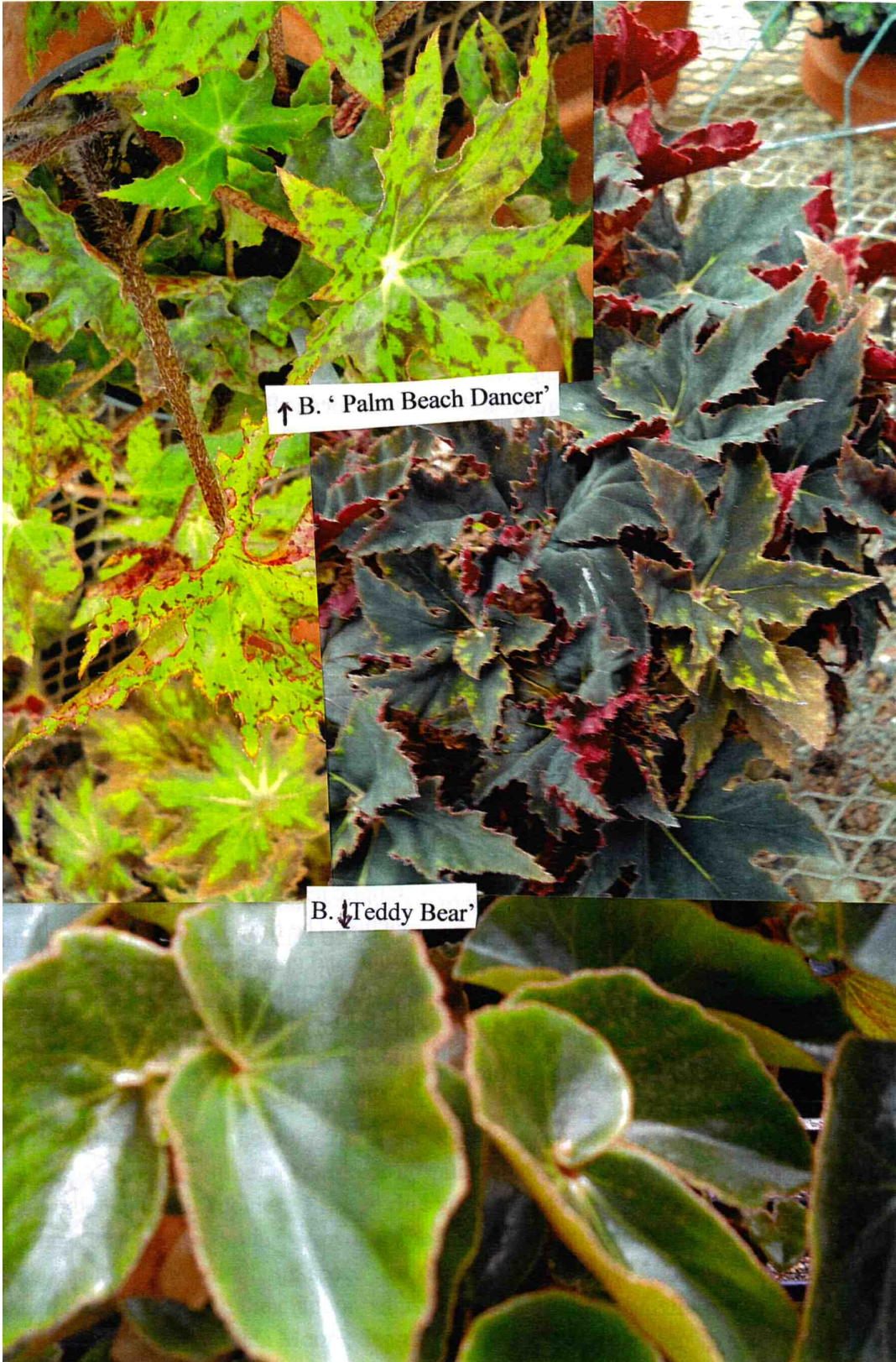
↑ B. 'Palm Beach Dancer'