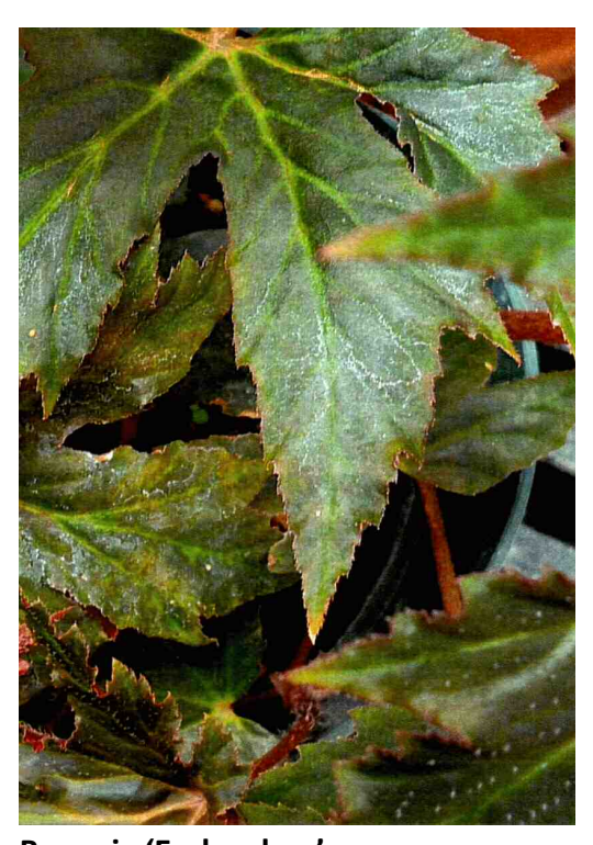
Begonia 'Earl ee bee'