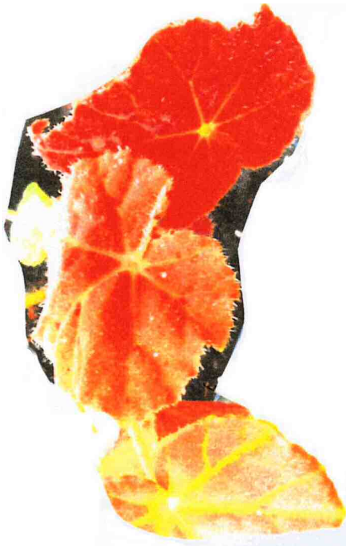
B. 'Autumn Embers'