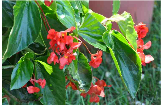
Dragon Wing Begonia

A Dragon Wing Begonia is about 2-3 feet tall with deep, glossy green five inch long leaves and drooping clusters of flowers. Both begonias are canes. The angel wing begonia has green leaves with white spots. The difference is in the coloration of the leaves.