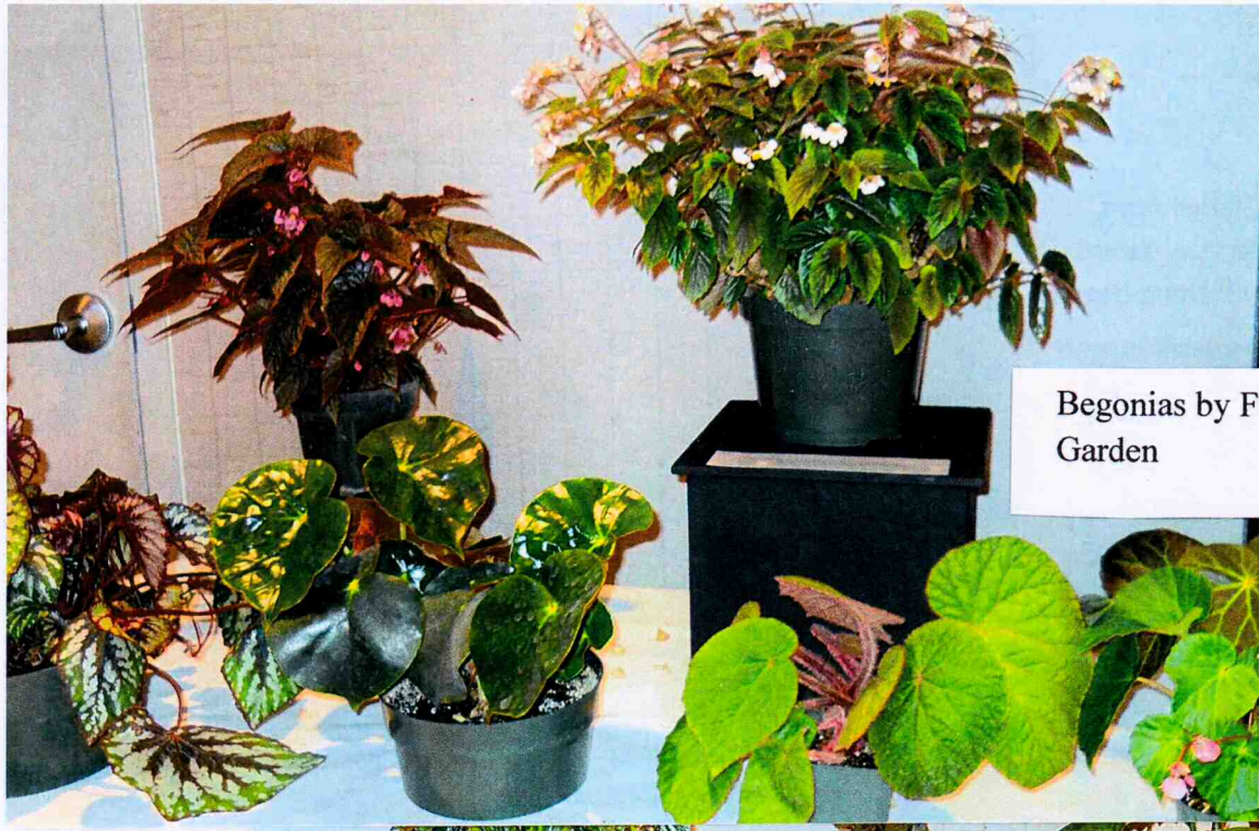
Begonias by Fort Worth Botanic Garden