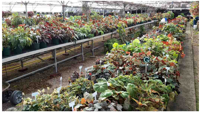
The Collection Greenhouse