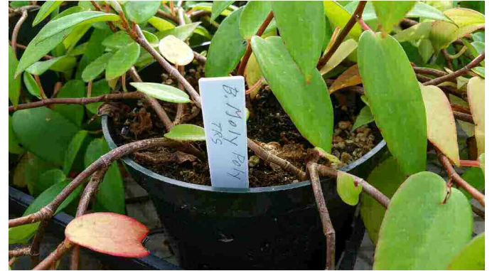
B. Moly Poly