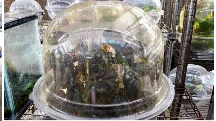
The terrarium collection — not for sale!