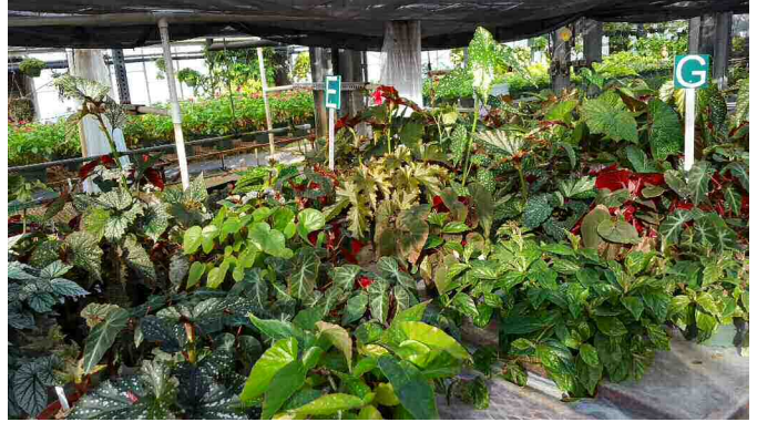
All plants $5 apiece