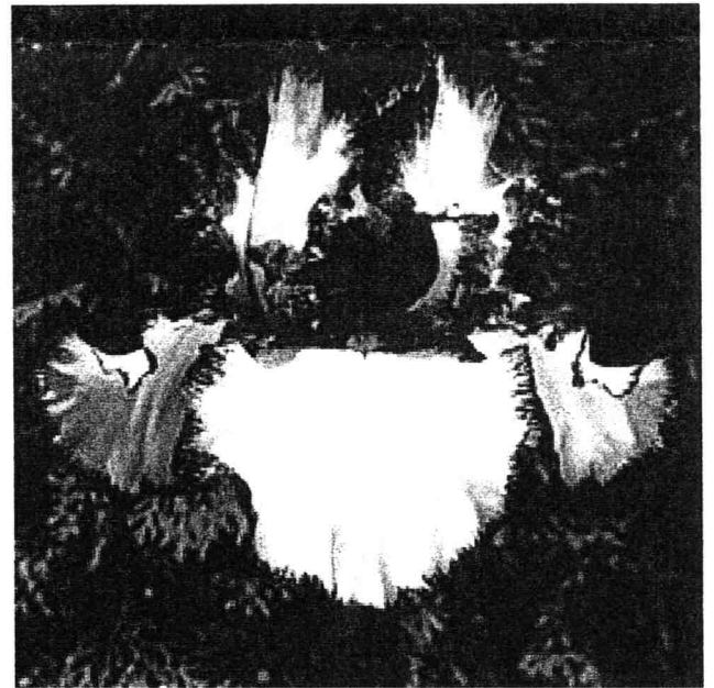
"Rare Treat" – White plicata with cornflower blue stitching (Schreiner '87)