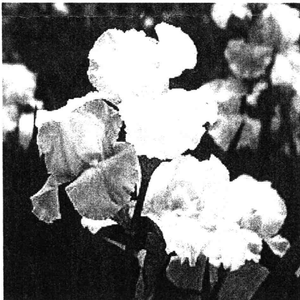
"Immortality" – White Self TB (rebloomer) (Zurbrigg '82)