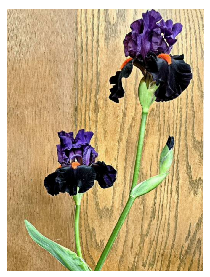
'Black Comedy' - Donna Little