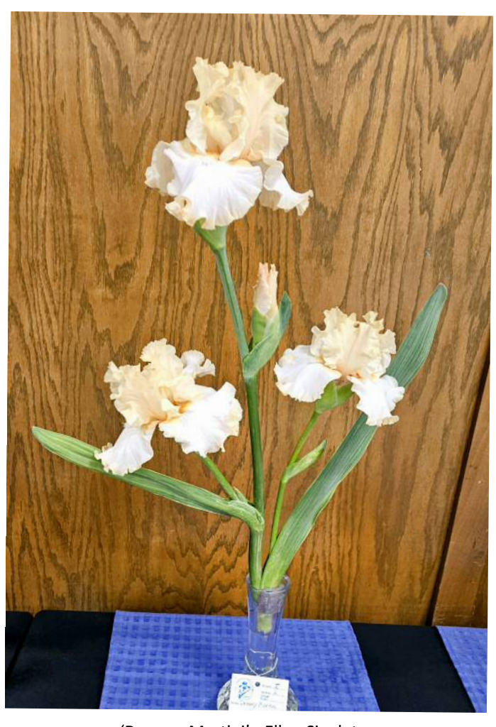
'Dreamy Martini' - Ellen Singleton