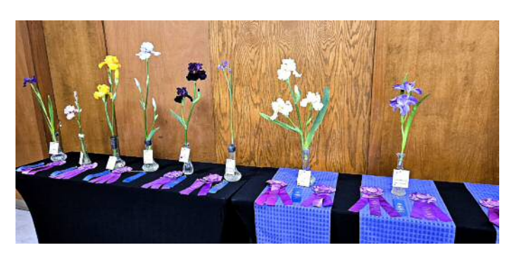
The Head Table