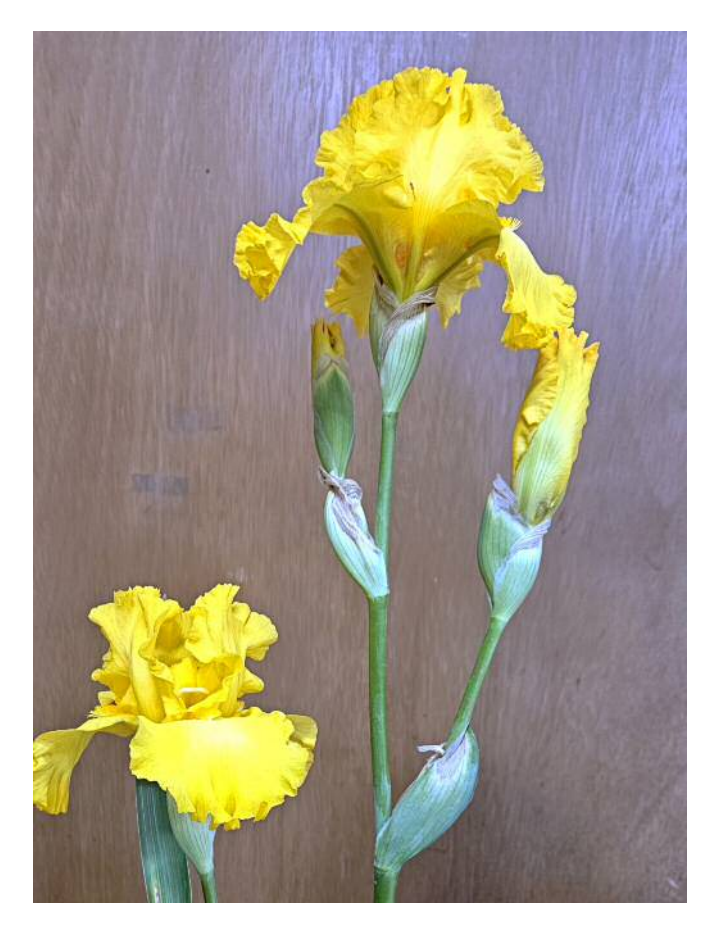
'Garden Time' - Joyce Evans