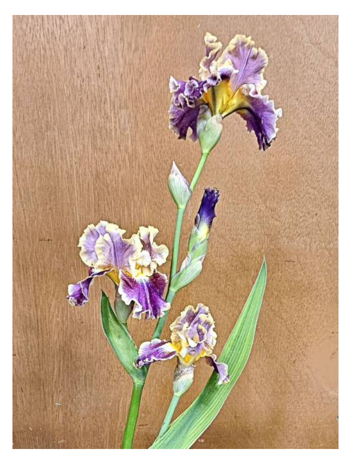
'Montmartre' - Ellen Singleton