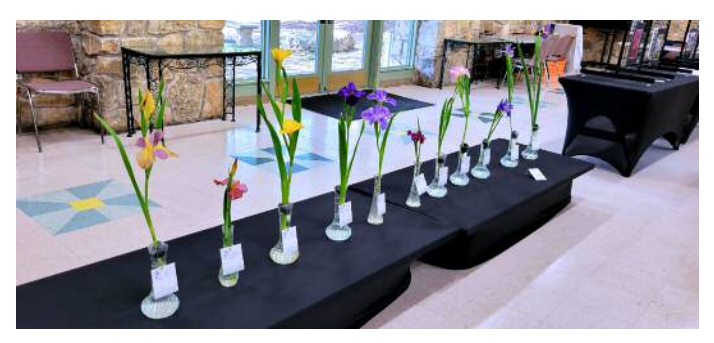
Louisianas and Spurias (Tracey Rogers)