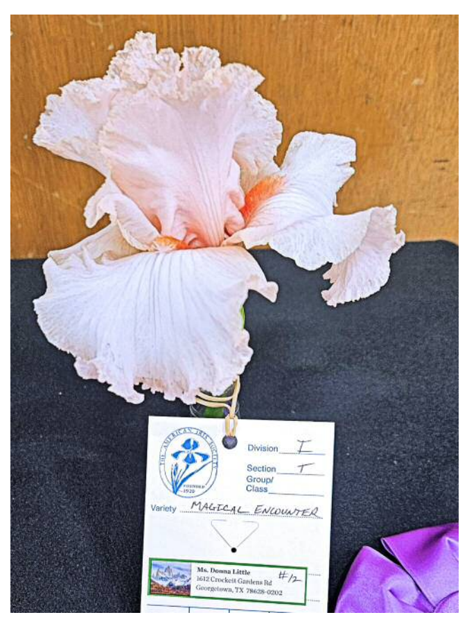
'Magical Encounter' - Donna Little