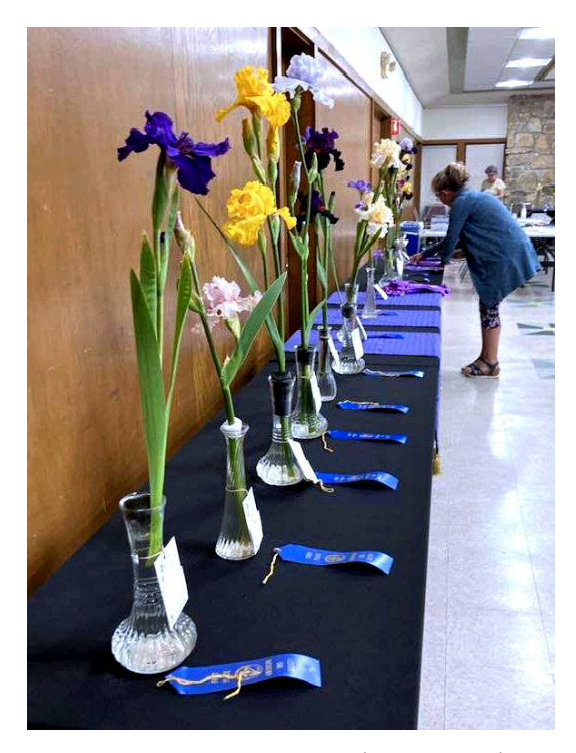
Setting up the Head Table (Connie Ford)