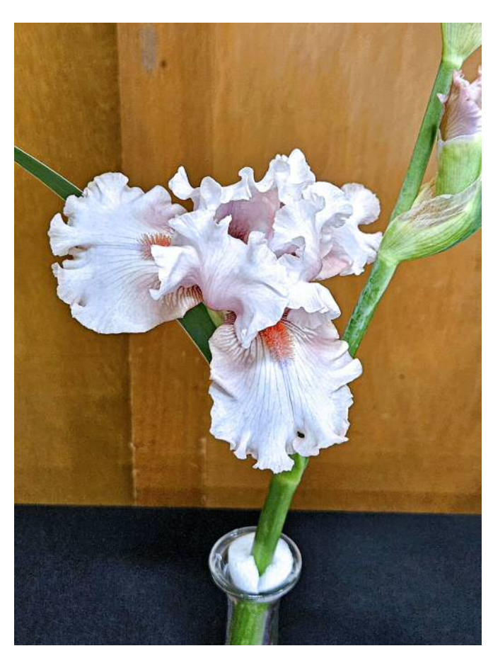
'Double Platinum' - Ellen Singleton