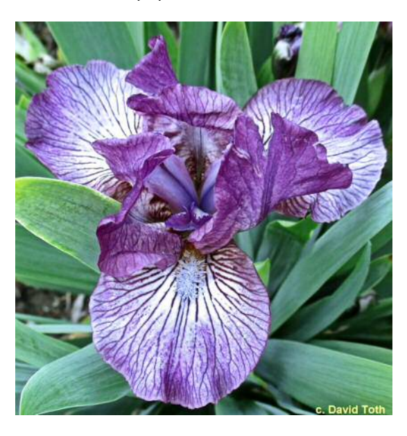
'Worlds Collide' - Toth 2023 SDB