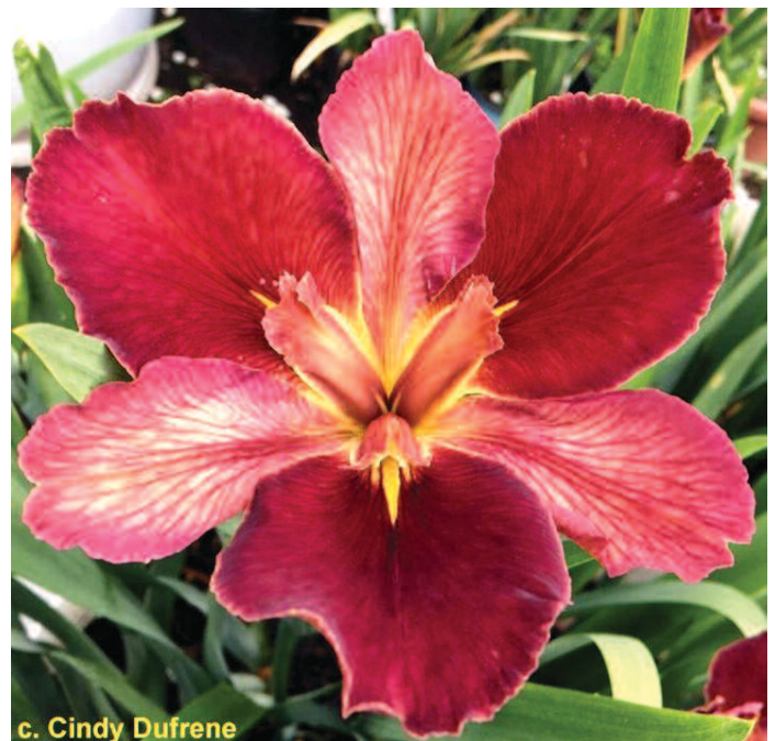
'Heartbreak Warfare' - Nichols 2013 LA

Spurias use rose food that you use to feed your prize rose bushes that can be pruned at this time unless it is a climber. Hooker buys 8-8-8 fertilizer and uses that on his iris garden.