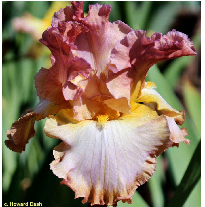
'Heartfelt Desire' - Dash 2020