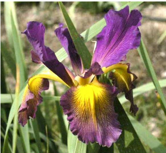
'Heart to Heart' - Ghio 1980 SPU