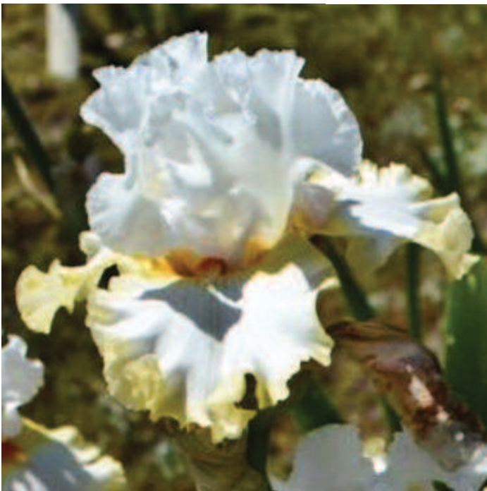
'Heart of Dreams' - Blyth 2012