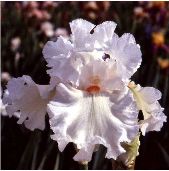
'Heart Mountain' - Mohr 1989