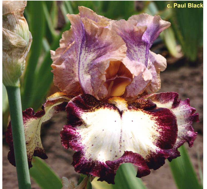
'Heartfelt' - Black 2018