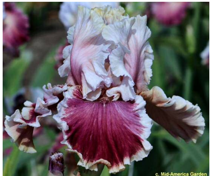
'Heart Racer' - Blyth 2019