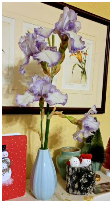
Tracey Rogers' 'Over and Over' - December 18, 2022

The Iris Society of Austin usually meets in the Austin Area Garden Center on the second Tuesday at 6:30 P.M. and anyone interested in irises is always welcome to attend and learn more about this interesting xeriscape flower to enhance a landscape.