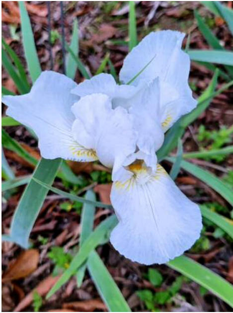
'Lo Ho Silver' - December 3, 2022