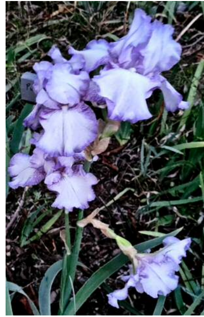
'Over and Over' - December 18,