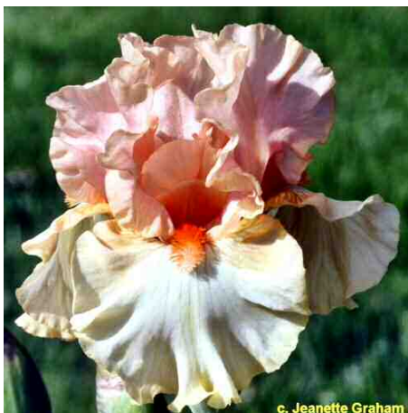
'Bundle of Love' - Black BB 2007