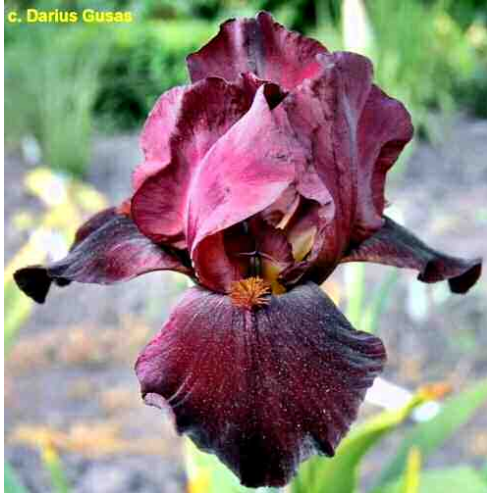
'Cranapple' - Aitken BB 1995

'Bottled Sunshine,' an IB, 'Bundle of Love' a Border Bearded, and 'Cranapple' also a BB do well. One that needs replanting sometimes is 'Batik,' which never has the same markings on the blooms. Each flower is marked differently.