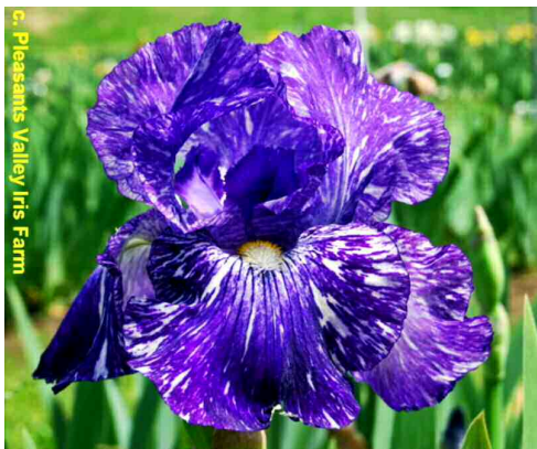
'Batik' - Ensminger BB 1985