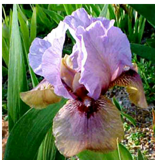
'Prairie Thunder' (AB)