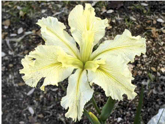
'Edna Claunch' blooming January 9, 2021 in Kathy Pethram's garden

Last month a few reblooming irises in new ground were standing 5 feet tall. The buds turned to flowers even after the first snow provided some moisture in this drought. Many tropicals like hibiscus remained in blossom. What surprises came our way!