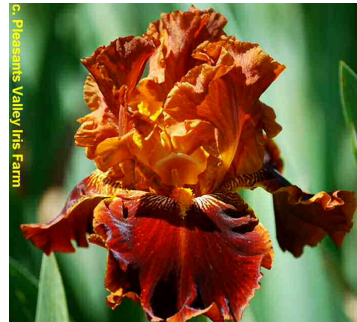
'Rustler' - Keppel 1987