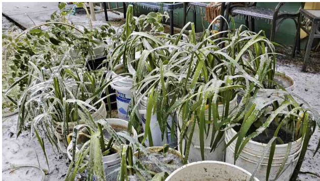
Jim Landers' Louisiana irises and potted TBs after the ice storm February 12, 2021

Then one snow storm after another came followed by an ice storm. Texas became a wintry wonderland that one had not seen in 73 years with 8 inches of snow and ice for at least 5 days. Doves that needed a rest stop flew to oak limbs protected by cedar or junipers with their evergreen foliage. Not only humans suffered but wildlife came together to survive the 5 to 27 degree temperatures with wind chill below zero.