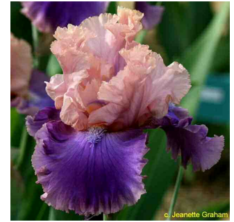
'Florentine Silk' - Keppel 2004