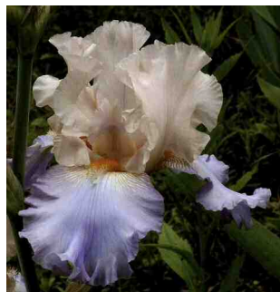
'Celebration Song' - Schreiner 1993