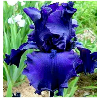
'Dusky Challenger' - Schreiner 1986