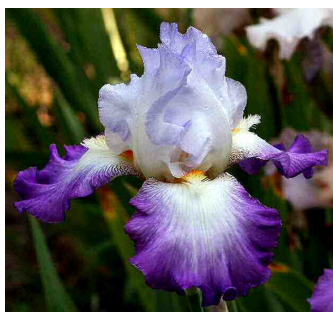
'Conjuration' - Byers 1988