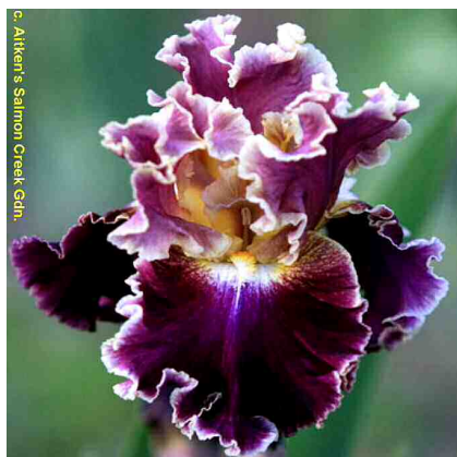
'Montmartre' - Keppel 2007

'Montmartre' by Keith Keppel is a 2008 luminata with greyed purple standards with straw yellow edges and falls that are red purple with a narrow oyster rim. The beards are chrome yellow with white at the end. It has great growing habits that a show winner needs.