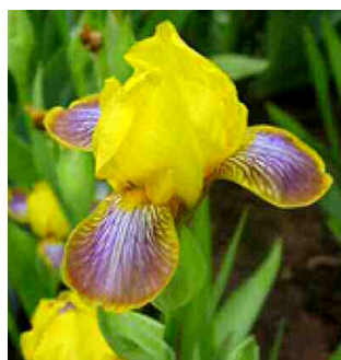
'Madame President' (MTB)