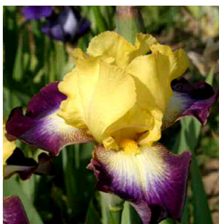
'Go For Bold' (BB)