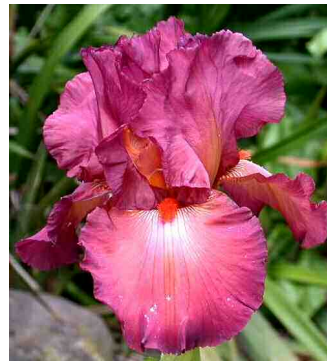
'Lady Friend' - Ghio 1980