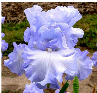
'Absolute Treasure' - Tasco 2006