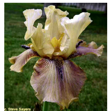
'Thornbird' - Byers 1988