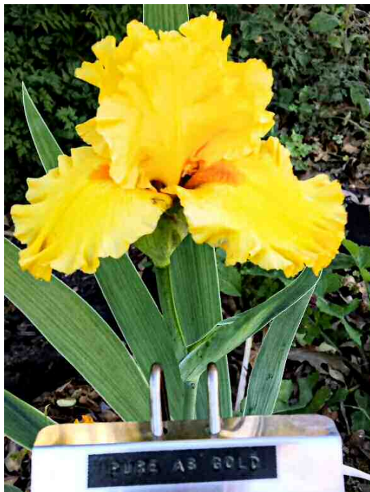
'Pure as Gold' (Maryott 1998)