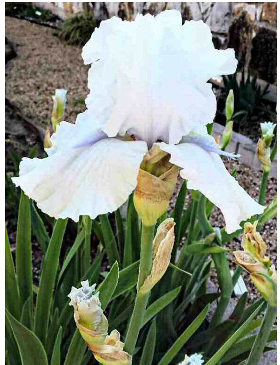
'Austin City Blues' (Nichols 2009)