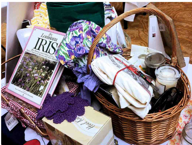
2016 AIS/Region 17 Basket, Newark Convention