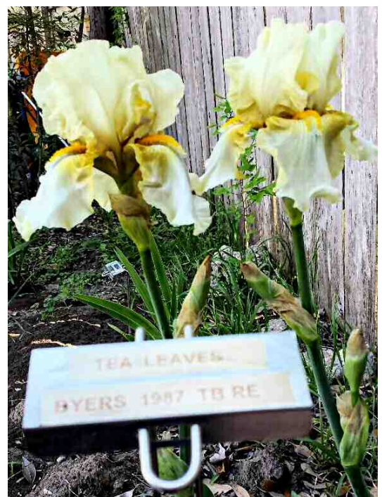
'Tea Leaves' (Byers 1987)