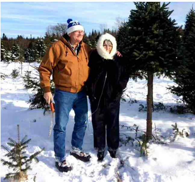
December 17, 2016

Place in greased 9 X 13 pan. Refrigerate 8 hours or overnight. Bake at 350 degrees for 30 minutes or until done.