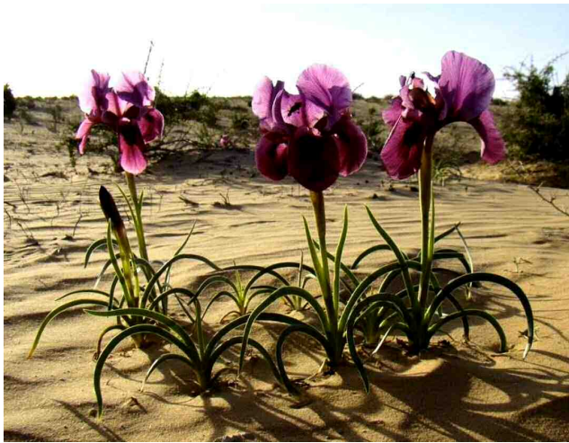
Irises in Turkey (Facebook)

“No one realizes that they will have the once in a lifetime opportunity to see a true red iris, a botanic phenomenon that has never been seen before. However, by convention's end, some of the unsuspecting will encounter a fatal danger lurking in the gardens.”