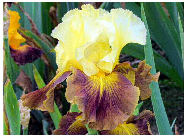
'Sing with Frogs'