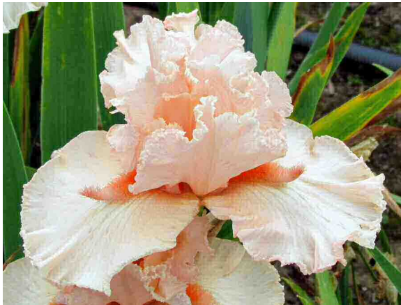
'Love in the Air'

Do not miss the program this November when Ken Fuchs will show more blooms from Portland, Oregon.