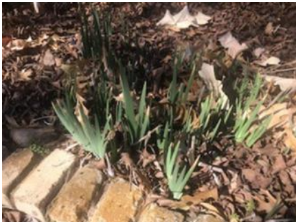
Spurias on the east side of the house protected from the wind

few weeks ago are now light brown or beige. The spuria irises in my yard were dealt quite a blow by the hard freeze. On the day the temperature began to drop dramatically, the clump of spuria irises by my backyard fence seen in the photo was deep green and off to a wonderful start for spring. The hard freeze changed all of that within a day's time. However, I have noted that this appears mostly on the older leaves. There are new leaves emerging. By the time spring rolls around, those older leaves will likely have been shed already. Surprisingly, the spuria irises emerging on the east side of the house suffered little or no damage. They were somewhat protected from that brutal wind. The oak and sycamore leaves from my neighbors' yards provided