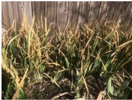
Freeze damage to spuria irises by the back fence

On your walk through your garden, I am sure you will find many reminders of the hard freeze we had in December. While it is discouraging to see the loss of some plants that normally make it through a freeze, it is encouraging to note that the irises are already bouncing back. The ends of leaves that were green a