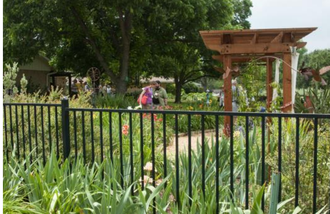
Reed Garden in Farmers Branch

We are excited to have a guest speaker from Farmers Branch co come talk to us about Preparing Your Garden for Spring . In his presentation, he will discuss year-round garden activities to maximize enjoyment and minimize maintenance. Irises and many companion plants will be covered in his presentation.