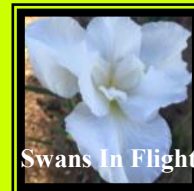
2016 Dykes Medal Winner

Website: http://www.kenfuchs42.net/waco_index.html E-mail: wacoiriss@gmail.com