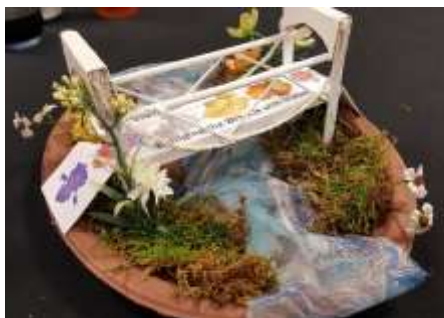
Bridging the Brazos with Irises