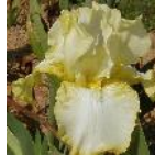
MATRIX Hall/Zurbrigg, 2001 Reported by Jim Landers