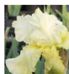
SUNNY DISPOSITION Zurbrigg, 1991 Reported by Jim Landers