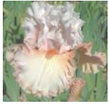
DOUBLE PLATINUM Ghio, 2011 Reported by Jim Landers