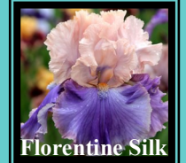
Florentine Silk 2012 Dykes Medal Winner