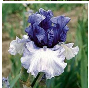
Crowned Heads , Keppel, 1996, DM 2004