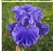
Sea Power , Keppel, 1998, DM 2006