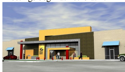
WEST WACO LIBRARY & GENEALOGY CENTER 5301 Bosque Blvd., Suite 275 Waco, TX 76710 254-745-6018