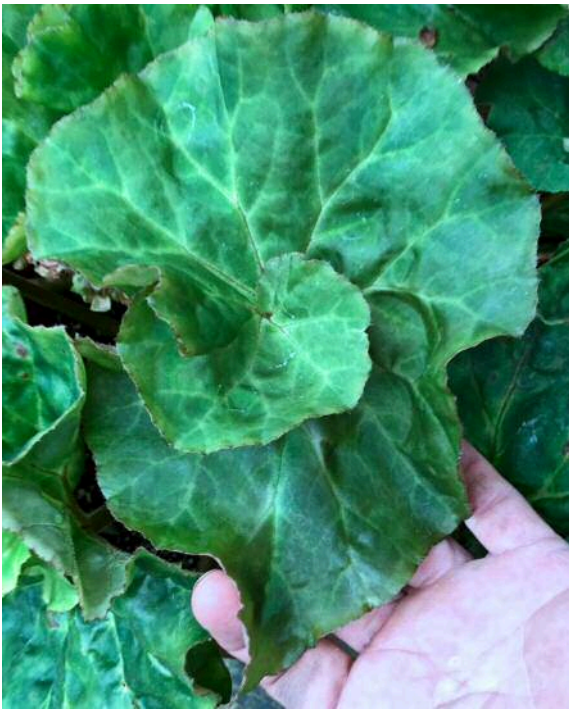
B. 'Holley's Beauty' - 2004 rhizomatous