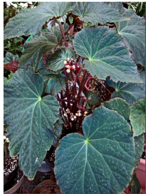
B. 'Freda's Mystery' - 2015 rhizomatous

Some others are B. 'Holley's Beauty,' B. 'Holley's Blues,' B. 'Holley's Dark Night,' a cane, B. 'Holley's Falcon,' B. 'Holley's Gem,' B. 'Holley's Green Giant,' B. 'Holley's Heartfelt,' B. 'Holley's Heron,' B. 'Holley's Skyscraper.' Then there are many hybridized in Louisiana, some with names of birds until 15 years later she ends as of today with a waltz and B. 'Miss Louisiana.'