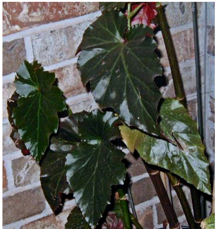
B. 'Holley's Green Giant' - 2000 rhizomatous