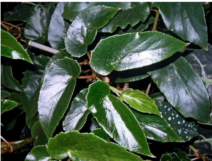
B. Holley's Heron' - 2000 shrub-like