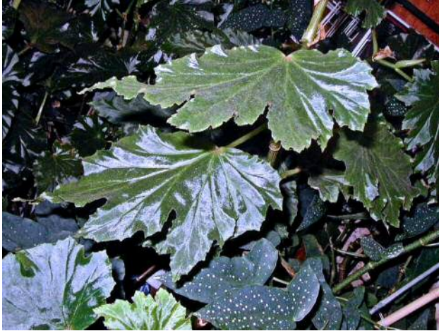
B. 'Caliph' - 2003 cane-like superba