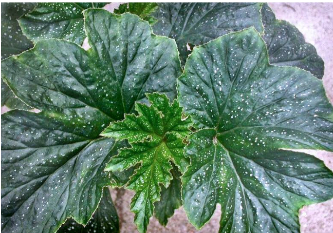
B. 'Holley's Heartfelt' - 2000 cane-like