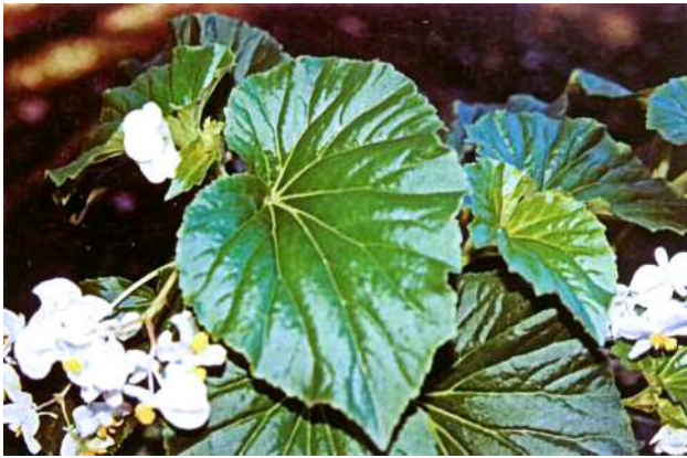
B. 'Dovecot' - 2000 shrub-like