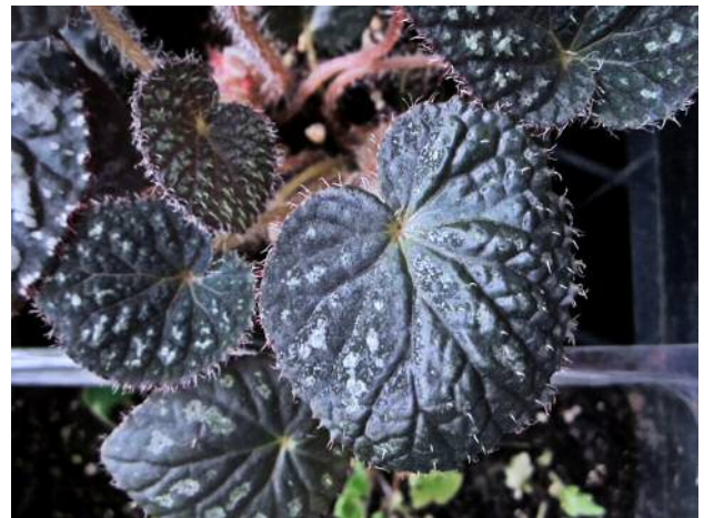
B. Emerald of Siam - 2018 rhizomatous