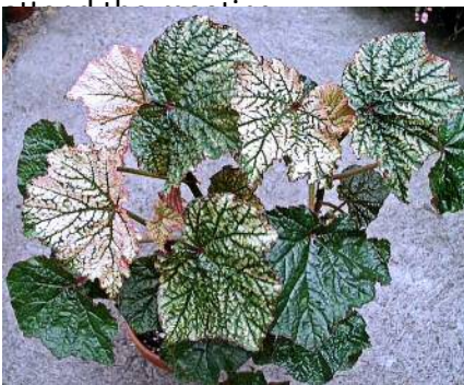
B. 'Gideon' - 2000 thick stem

At the July 28 meeting, there will be a discussion about a Plant Swap for the August meeting. Bring a begonia or one of those companion plants when you