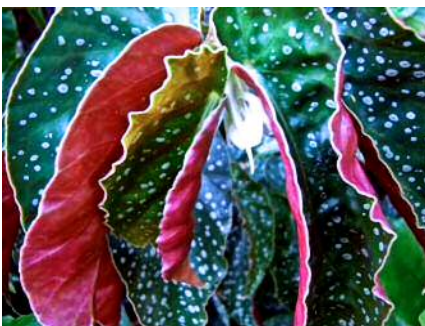
B. 'Holley's Falcon' - 2003 cane-like