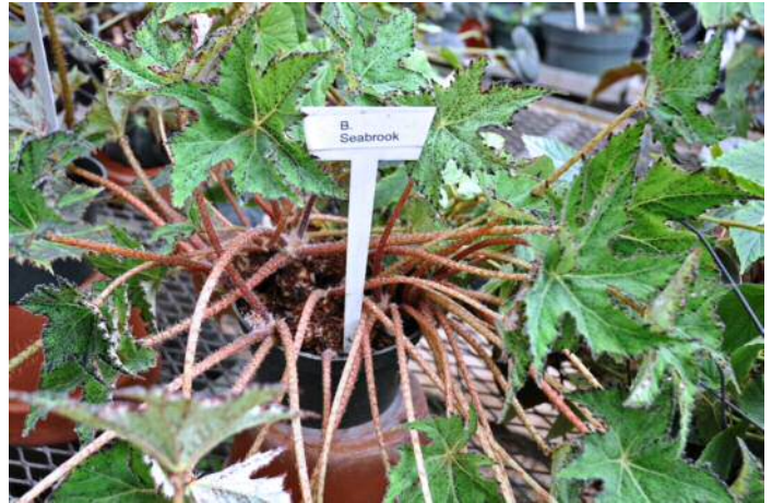
B. 'Seabrook' - 2012 rhizomatous