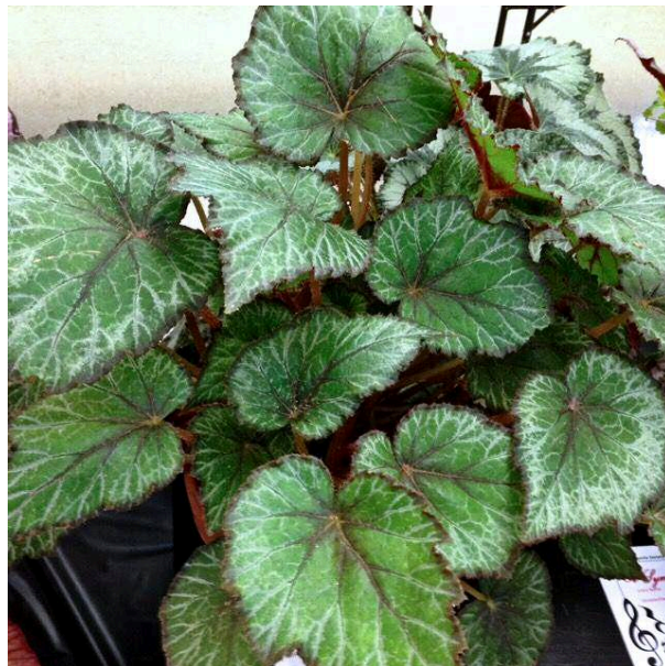
B. 'Miss Louisiana' - 2011 Rex Cultorum