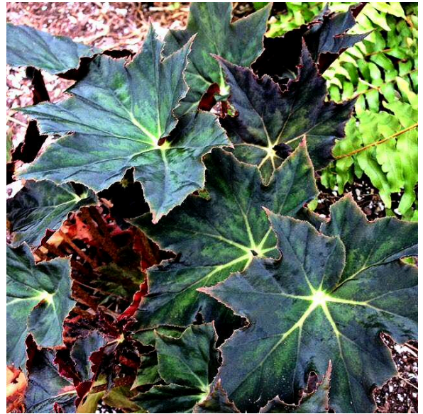
B. 'Joe Hayden' Rhizomatous

If you have plant cuttings from the following begonias such as Tim Anderson's hybrids and Greg Sytch's West Coast begonias or 'Lotusland,' 'Joe Hayden,' 'Marmaduke,' 'Silver Jewell,' 'Helene Jaros,' B. polygonnoides , B. convolvulacea , B. malabarica , B. acetosa , send your propagated 2 plants that you are willing to share to the 2024 ABS Convention in Long Beach, California August 20-24. See page103 in VOL 91 May-June 2024 The Begonian .