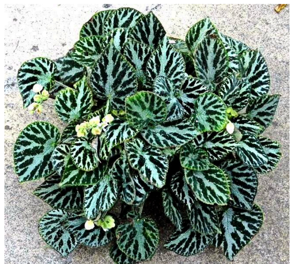
B. 'Silver Jewell' Rhizomatous