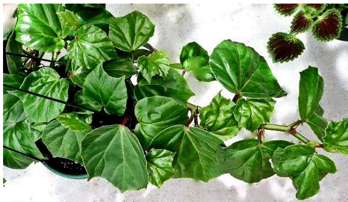
B. convolvulacea Trailing-Scandent