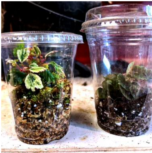
Share any two cuttings for the Convention Sale. Left: Begonia prismatocarpa 'Variegation' Right: B. hoehneana