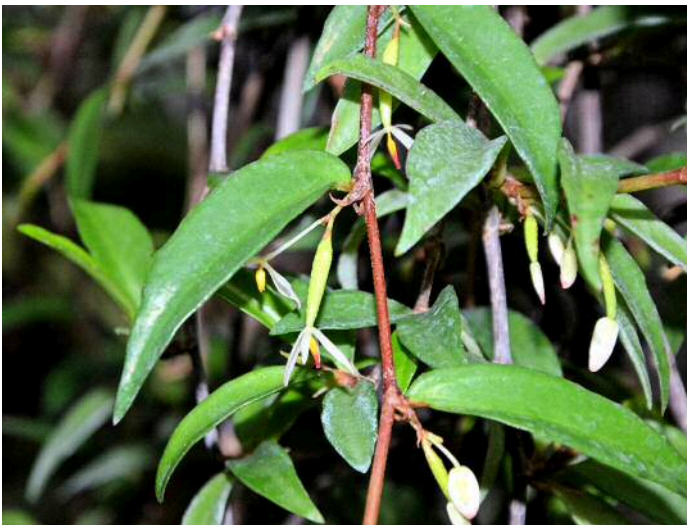
B. polygonoides Trailing-Scanden