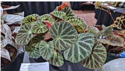
BEST IN SHOW: B. ningmingensis var. bella - Darren Heppel

https://www.youtube.com/watch?v=Bm9n2soYEQE&t=547s