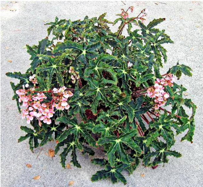
B. 'Helene Jaros' Rhizomatous