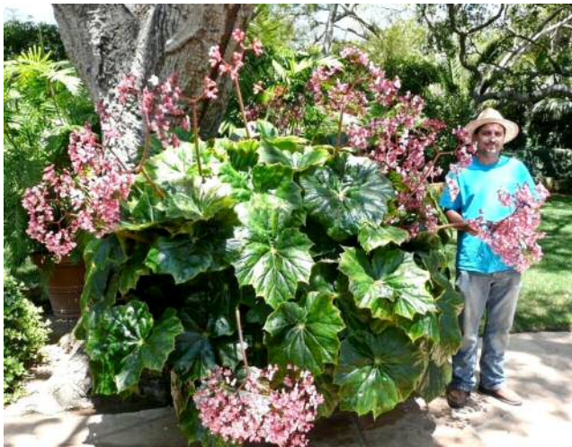
B. Lotusland' Rhizomatous