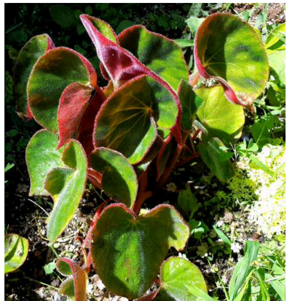
B. acetosa Rhizomatous