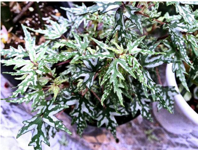
B. dregei Glasgow Semi-Tuberous

B. dregei 'Glasgow' is a tuberous natural species. Its leaves are spotted silver var. macbethii 1891 with leaves deeply cut, but without purple veins. It has small white flowers.