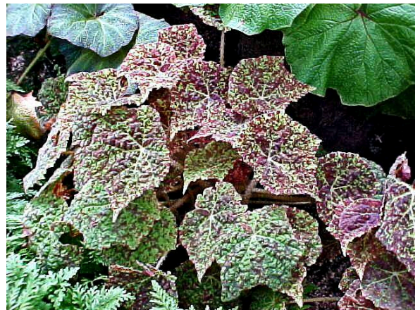
B. 'Marmaduke' Rhizomatous