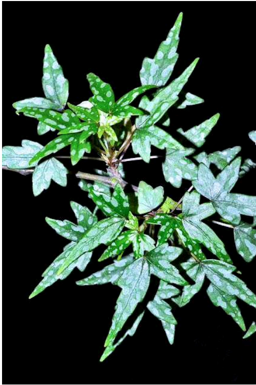
B. dregei Semi-Tuberous

B. dregei 'Glasgow' is a tuberous natural species. Its leaves are spotted silver var. macbethii 1891 with leaves deeply cut, but without purple veins. It has small white flowers.